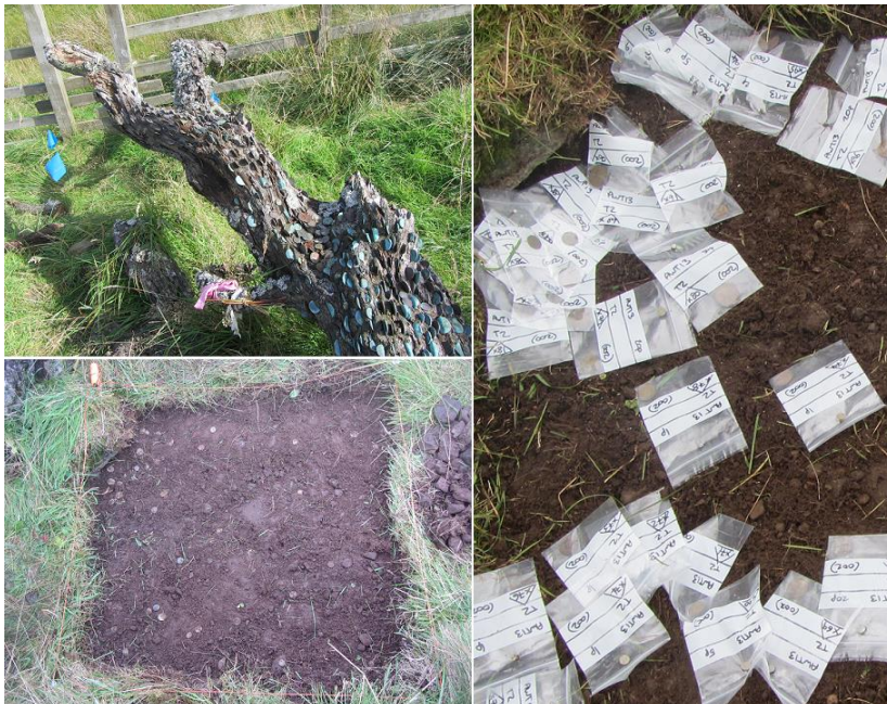
The Ardmaddy Wishing-Tree Excavation. Top left: the Ardmaddy wishing-tree. Bottom left: Coins excavated in test pit. Right: Excavated coins placed in finds-bags and surveyed in situ