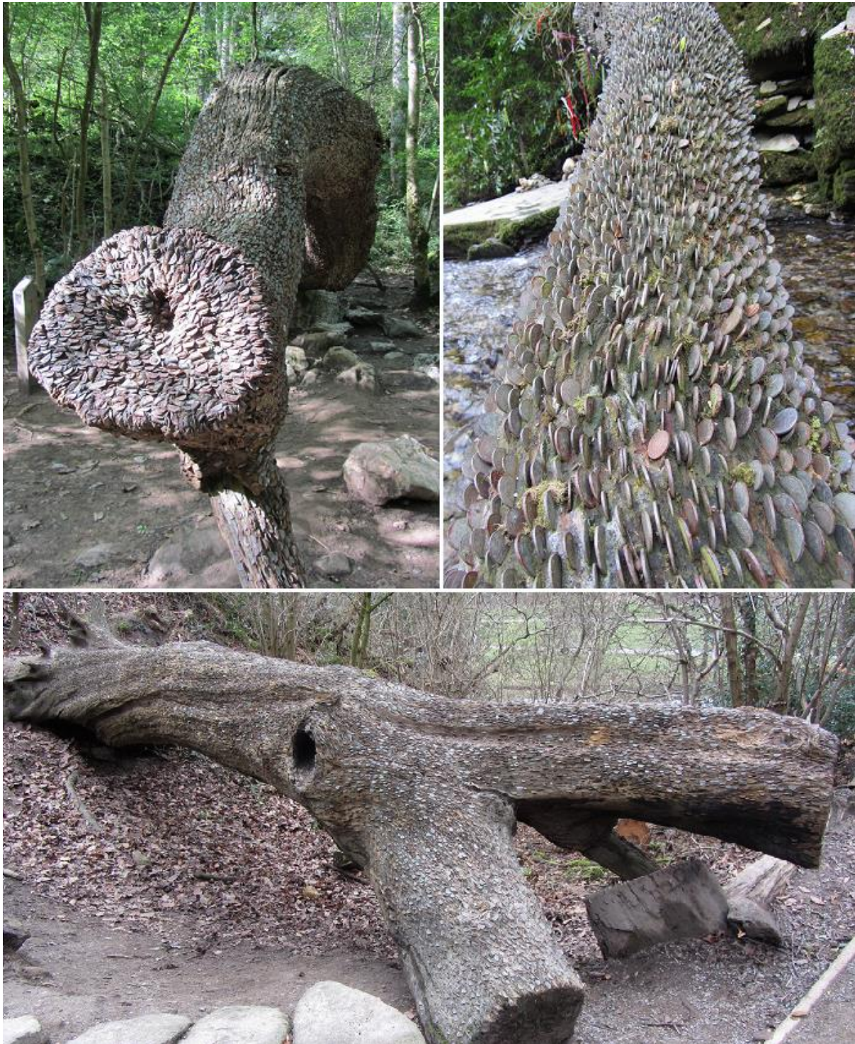
Examples of contemporary British coin-trees. Top left: Ingleton, Yorkshire. Top right: St. Nectan's Glen, Cornwall. Bottom: Bolton Abbey, Yorkshire