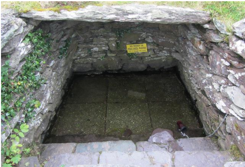
Sign discouraging the deposition of coins at St. Finbarr's holy well, Gougane Barra, Co. Cork