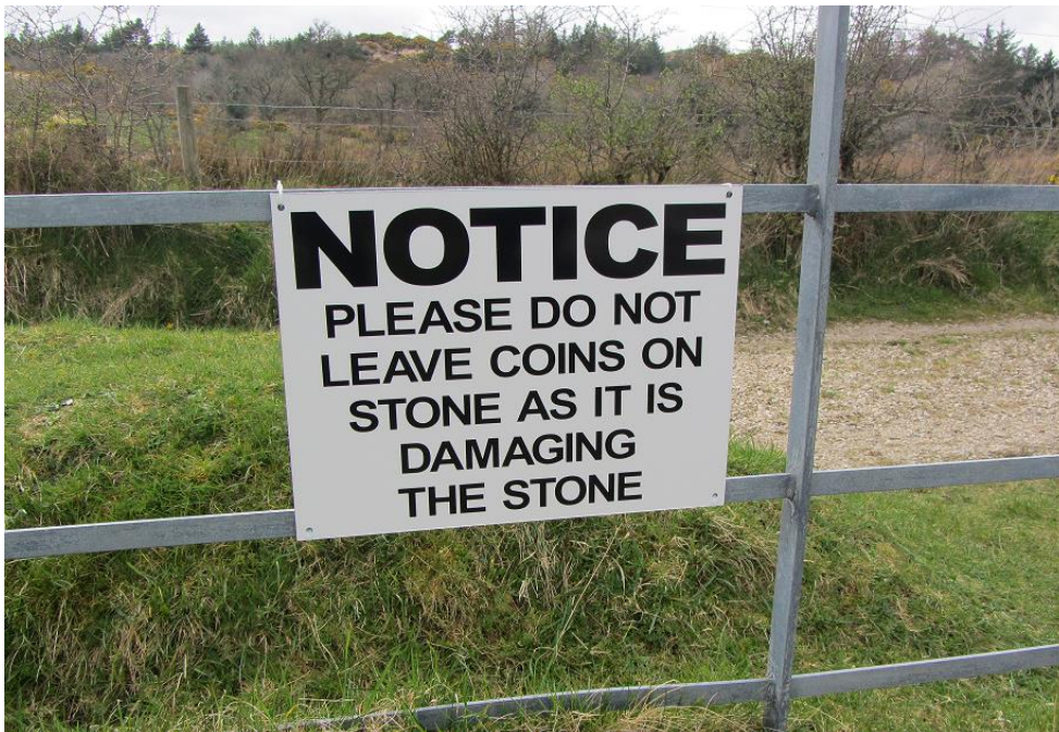
Sign discouraging the deposition of coins at St. Colmcille's birthplace, Gartan, Co. Donegal