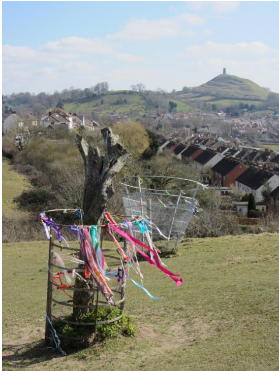
The Glastonbury Thorn surrounded by contemporary deposits