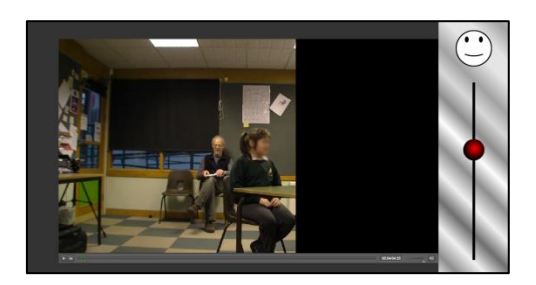
Fig. 3. Engagement coding program

The coders were given brief instructions on what may constitute engagement. However, it was ultimately left to the coder to decide what they personally considered to be engagement. The coders would move the slider up and down on a touch screen according to how engaged they personally felt that the child was in the interaction partner. The coding occurred at the normal video running speed and the program logged where the slider was on the screen in relation to the position of the video. The program logged the position of the slider 10 times every second, and all occurred in one continuous run with no pausing or rewinding.