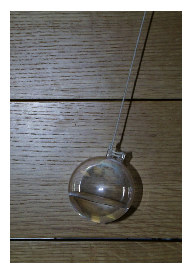
Figure 1 : The water level in an oscillating pendulum

One of the nice benefits of these 'kitchen sink' experiments is that the students tend to look on them as open fresh territory. We suggest a contrast with a traditional physics experiment that has attached to it a very concrete outcome. Students are honed in to those observables that lead them to the answer. They are accordingly less likely to observe the general nature of the phenomenon in hand. A nice example to illustrate this uses the acrylic sphere again. Partially filled with water, the sphere is suspended from a wound rubber band and released. The rise of the fluid surface up the sphere is impressive, and students can watch to see how the fluid surface changes shape and note the propagation of small surface waves as the spin speed and direction change during the oscillation. So we find that investigating the effects of changing rotation, and the unusual shape of the vessel, can give renewed life to the classical problem of a cylinder of fluid in uniform rotation.