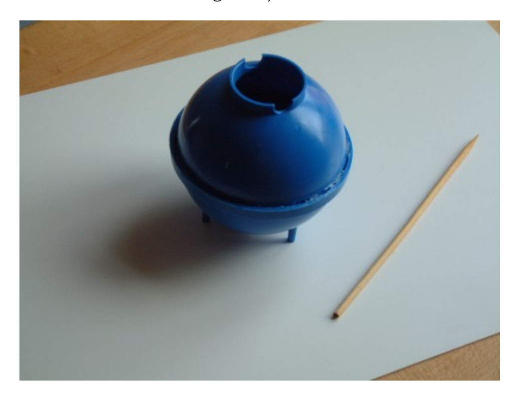
Figure 2 (below): The wax candle mould (separated into two hemispheres to show the small drainage hole)