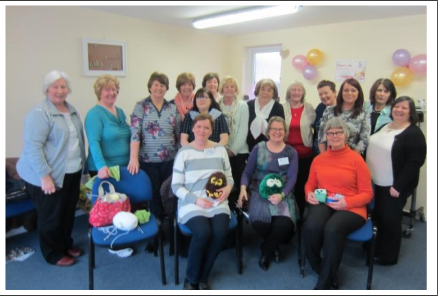
The final conference organized by DLR provided to the partner representatives opportunities to meet local professionals and also activists of other civil society organisations involved in placemaking