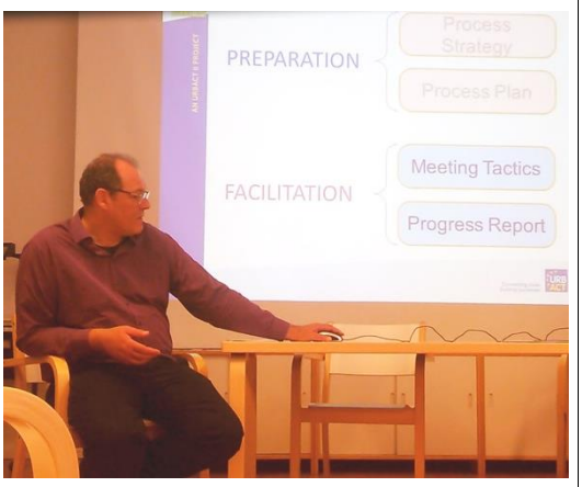
Training on facilitation of public meetings provided by DLR during the Pori exchange visit.