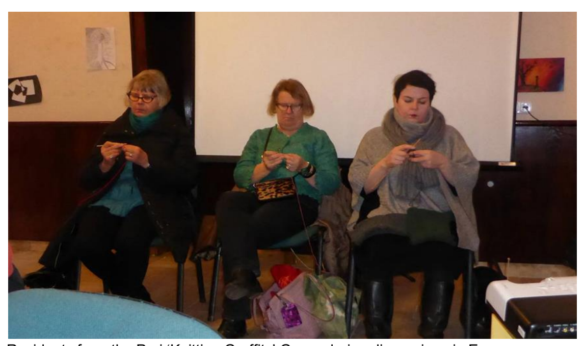
Residents from the Pori 'Knitting Graffity' Group during discussions in Eger

Familiarity between GPT partners enhances the learning process and should be encouraged, but this is unlikely to be a consistent feature of GPT networks. What should be considered, however, is that the giving partner, and ideally the officers identified as the actual providers of the good practice, are familiar with the URBACT programme. Unlike in Action Planning Networks, in the GPT it is the giving partner, in particular the officers providing the good practices, who have to provide much of the expert input into the exchange process. The experience from P4C suggests that this can be very demanding both in terms of time but also emotionally for the officers concerned. Hence some familiarity with the URBACT approach, the nature of URBACT networks and their dynamics would appear to be an advantage.