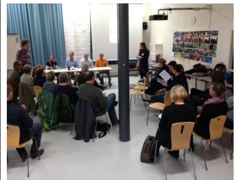
CommUniversity during the exchange meeting in Eger and Pori

Arranging a public meeting to share condensed messages is demanding at the best of times, doing this straight after a demanding peer review process put significant strain on participants. However, the ComUniversity created a process of closing the peer review, offering an opportunity for reflection on the main issues that had been discussed and listening to the views of local stakeholders on our findings tended to confirm many, but not all, of the suggestions and arguments that visiting peers had made. Seeing who would turn out to attend a late afternoon meeting was also informative and helped visiting peers to contextualise the reality of cultural and institutional frameworks in which their hosting peers operated.