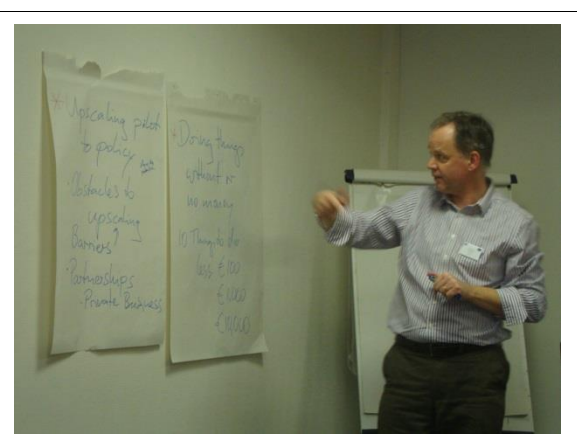
Partners developing the conceptual framework for P4C during the Kick-Off Meeting in Paris.