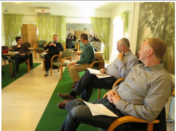
Peer-review discussions during the exchange meeting in Pori, September 2014.