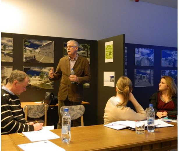
Discussion with partners in Eger on the challenges of the future of placemaking after the project.