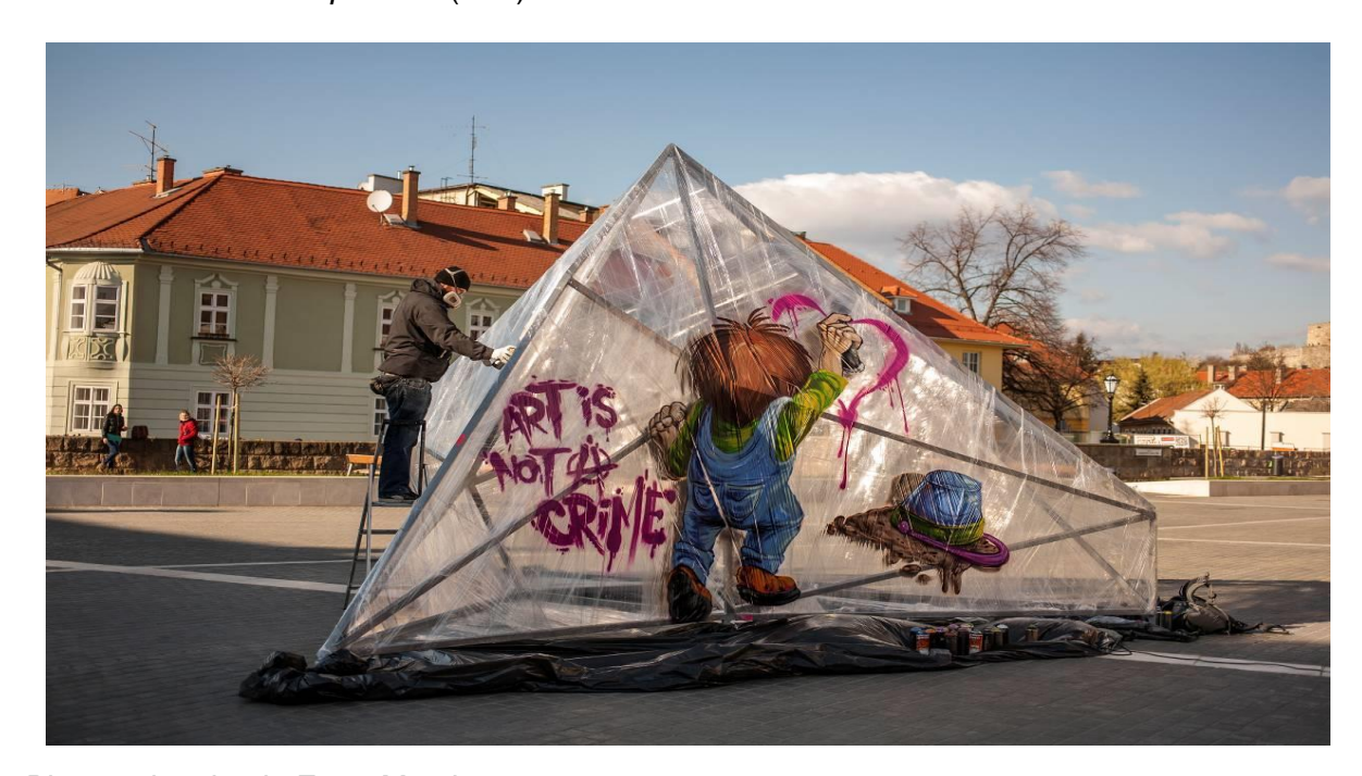
Place animation in Eger, March 2015

We need more information before the exchange visits. Like Albacete, which provided detailed information on the placemaking during the online meetings. We should have done more of that for each partner. (Pori)