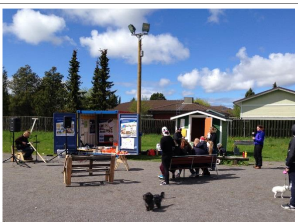
In Pori the concept of using a versatile container for placemaking was developed with residents and university students has been tested during the pilot and is used for new projects from spring 2015.