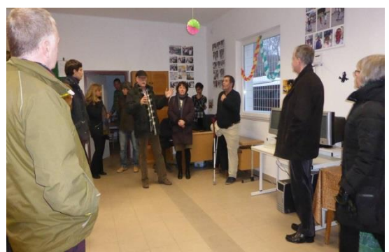
Exchange visit in Albacete, October 2014 and Eger January 2015.