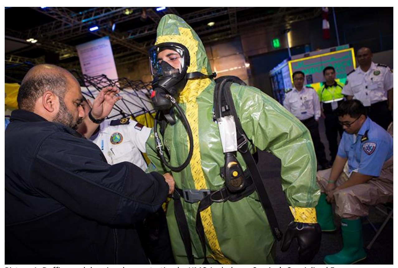
Picture 1: Doffing and donning demonstration by HMC Ambulance Service's Specialised Emergency Management team of a level C hazardous chemical protection suit with breathing apparatus.