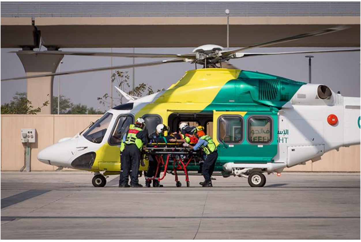
Picture 3: Live demonstration of HMC's helicopter emergency medical service capability.