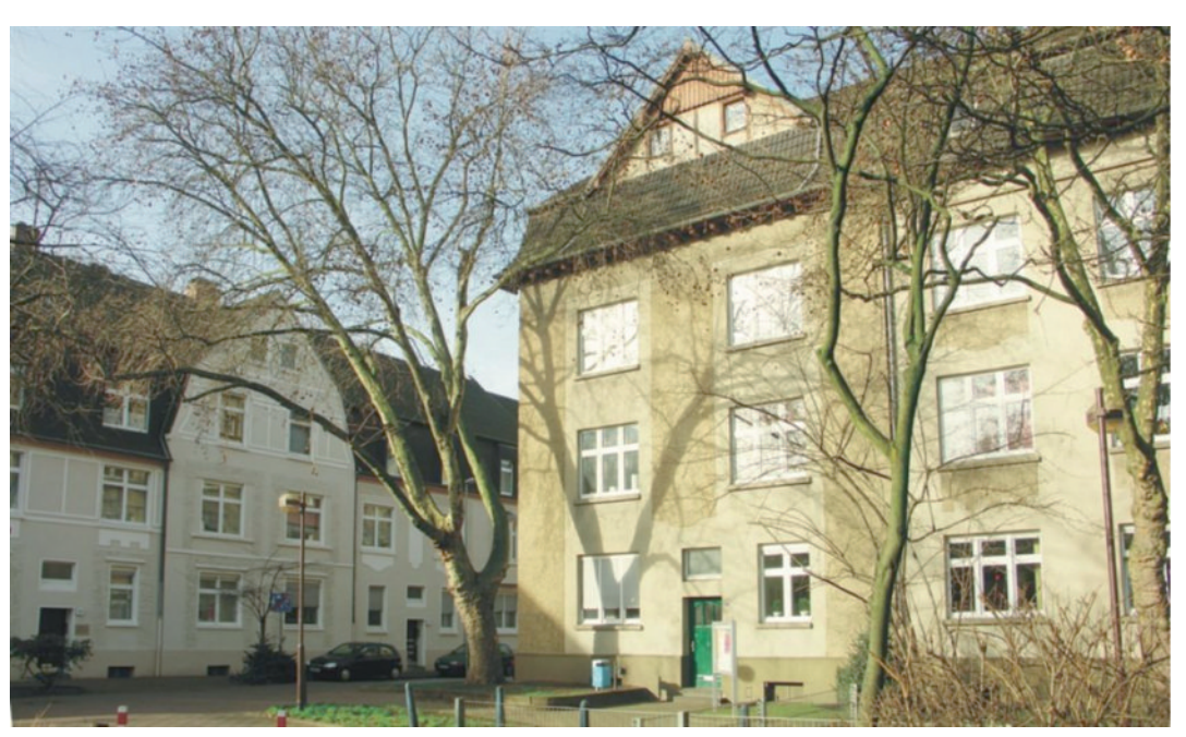
Duisburg-Dichterviertel (Photo: EG DU).

"Kaufhaus" is an old working-class neighbourhood close to the steelworks dating back to the beginning of the 20<sup>th</sup> century. Many of the residents are poor and are recipients of public assistance. No significant renovations have been undertaken on the housing stock since its construction. The apartment buildings are heated with coal, and between each floor there are only common bathroom