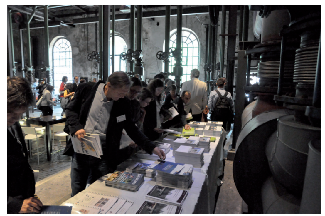
Dissemination of RegGov outputs.

Cover photo: Local Action Plan Launch Event at RegGov Final Conference, Duisburg, May 2011