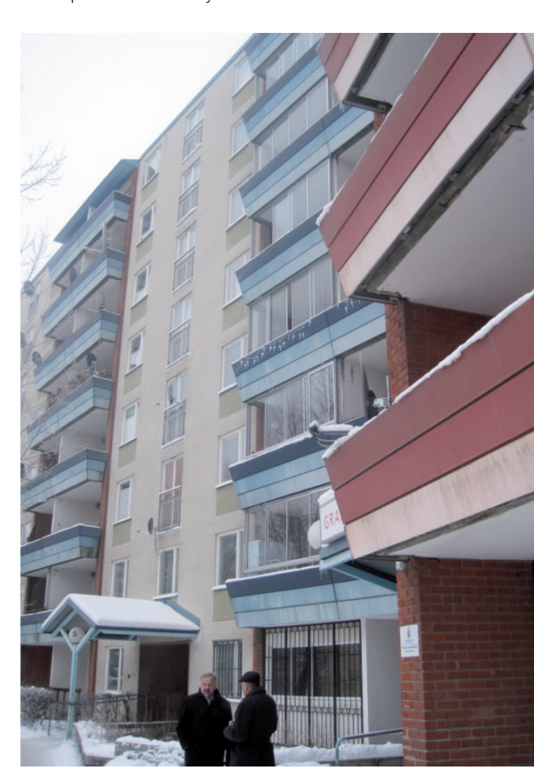
Ronna neighbourhood in Södertälje (Photo: P. Potz).

The target groups are, in particular, newly arrived immigrants and the long-term unemployed. The objective is to "cut unemployment periods from 7 years to 6 months".