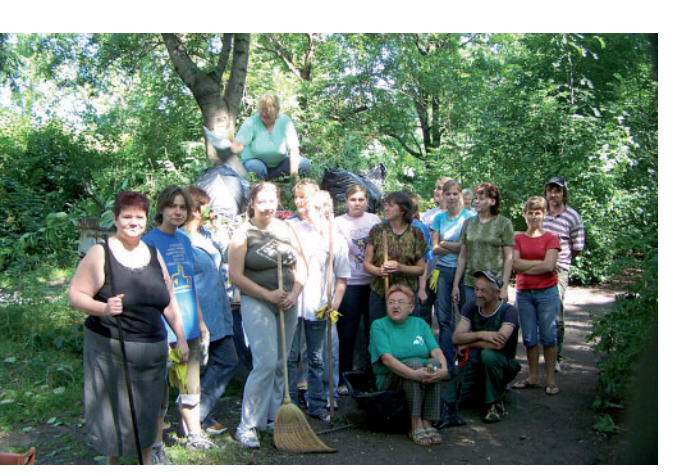
Kaufhaus estate: active residents (Photo: M. Szydlowski).

facilities. The first design projects for public spaces are now underway. A social work centre and a daycare centre have been constructed. Residents had lost confidence in municipal activities because many promises had been made, but change is very slow in coming. These were the main challenges when the community work in the neighbourhood began, with the goal of stimulating activity on the part of local residents.