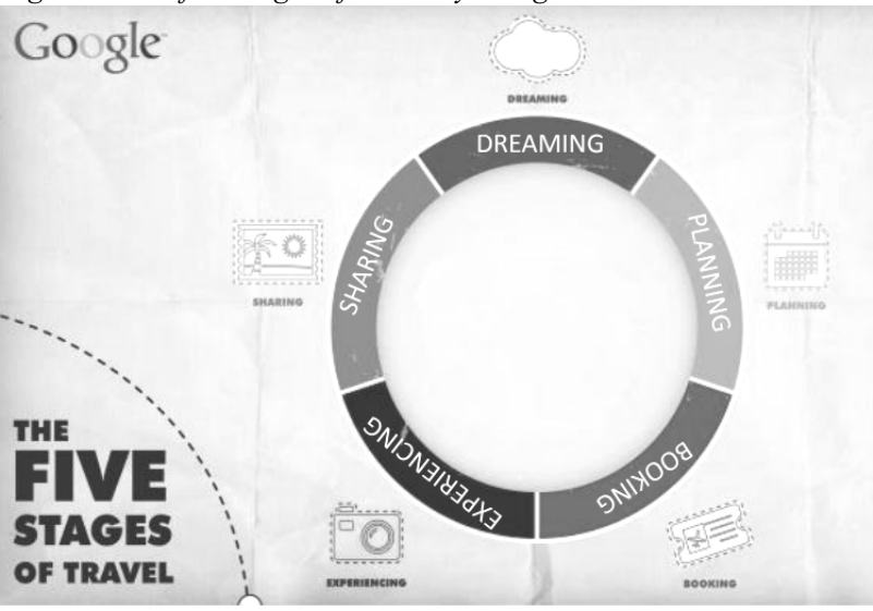
Figure 1. The five stages of travel by Google.

Nowadays, it is difficult to find a traveler that has not used Internet in any stage of their travel. A few years ago, in 2013, Google produced a study that laid out the five major stages of travel: dreaming, planning, booking, experiencing and sharing (Figure 1). These five stages of travel define the consumer's behavior before, during, and after their trip. Internet influences travelers at each of these stages through other travelers opinions, mainly in the form of Social Media and Online Reviews.