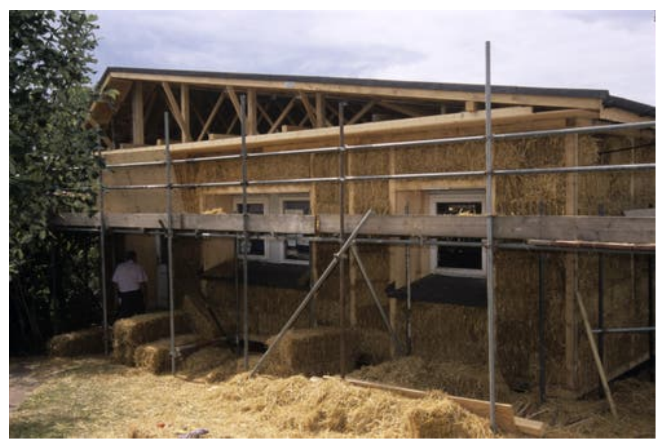
Wrington Primary Strawbale Project is designed to insulate the prefab school classroom by using strawbales

Nothing should be off the table when it comes to bringing climate change under control. We need to tap into the vast amount of solar energy that literally goes over our heads while we continue to use fossil fuels. And we need to use innovative financial models to supplement conventional finance, which is always in short supply and not easy to secure.