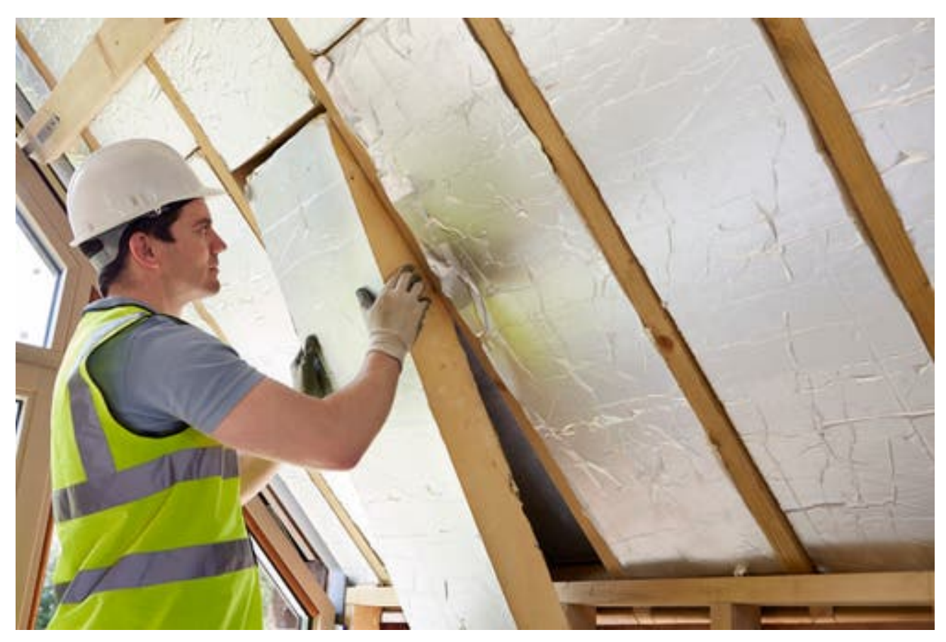
A builder fitting insulation into the roof of a new home

Numerous UK local authorities have declared a climate emergency, and are committed to constructing buildings to net zero carbon emissions, in many cases aiming to reach this by 2030. But the current UK building regulations do not even require new buildings to achieve operational zero emissions – that is, emissions from building use. Embodied emissions – emissions from making and using building materials – are not even on the radar of the local authorities.