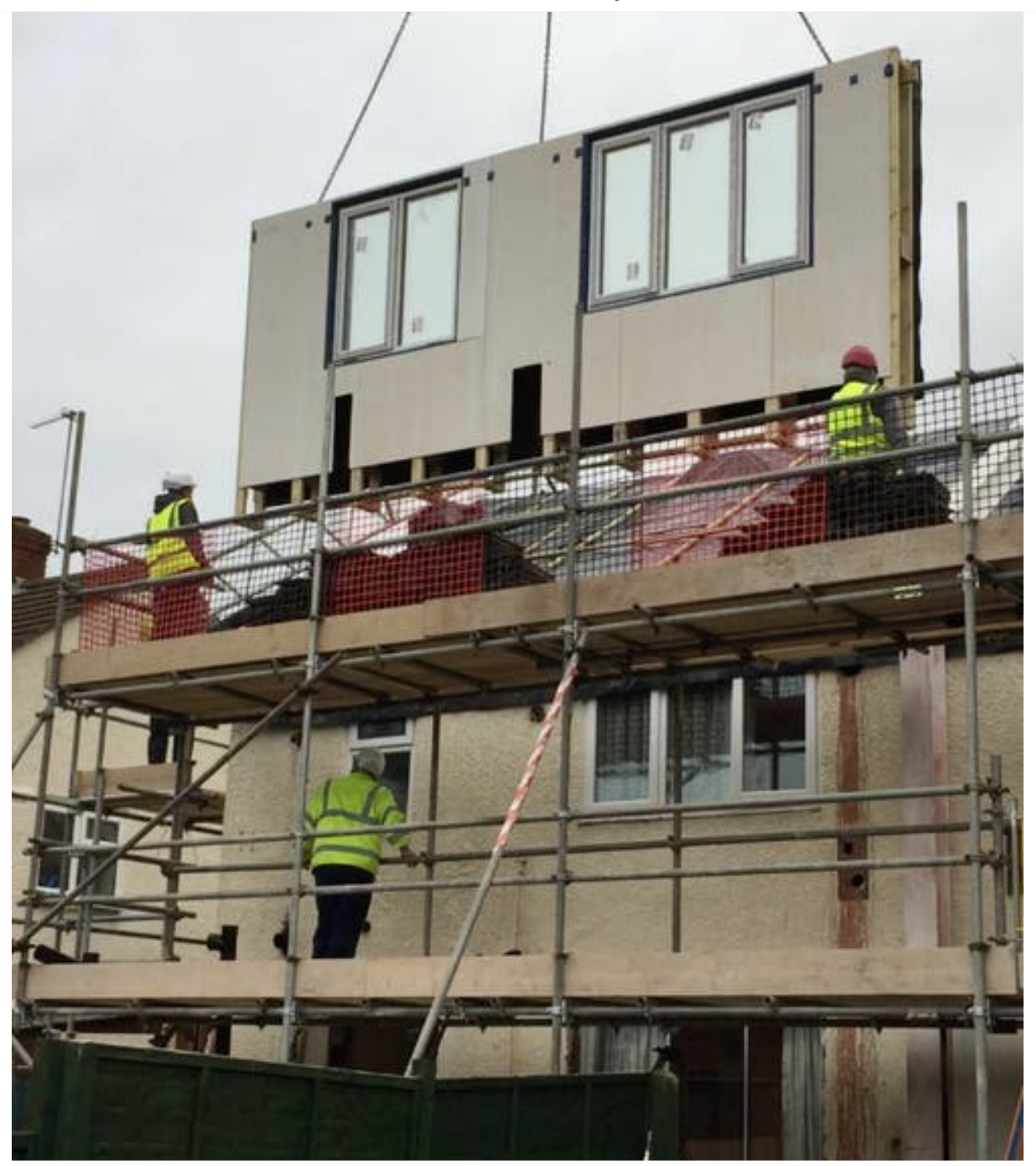
Installing external insulation in the retrofit project (Ljubomir Jankovic)

We know how to build or retrofit zero carbon houses – but we need to be doing a lot more of it. This is because big developers fear higher costs. This perception has resulted in zero carbon projects run as private and one-off initiatives.