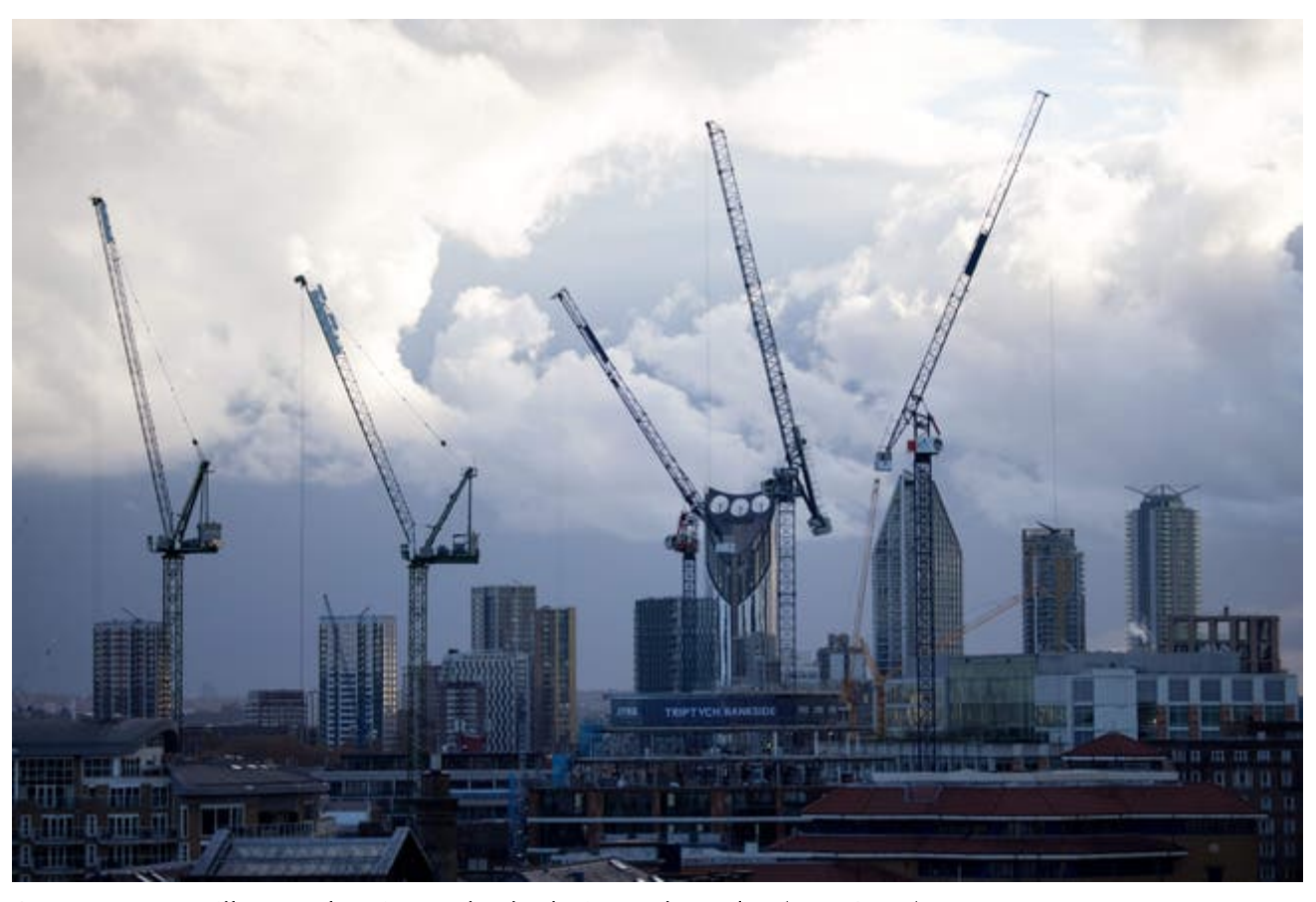
Cranes are seen silhouetted against a cloudy sky in south London

If we are to reach net zero the construction industry needs to have a radical overhaul... and fast, writes Ljubomir Jankovic