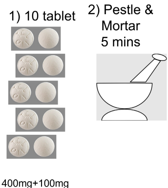
3 aliquots (0.8mg/mL + 0.2mg/mL)

3) Dissolve equivalent of 1 tablet in 500mL H<sub>2</sub>0 for 60 mins (500 RPM)