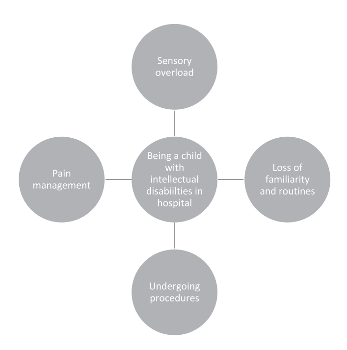
FIGURE 2 Key themes from the data.

being present with them, with only one child who was asked, selecting thumbs down in response to this.