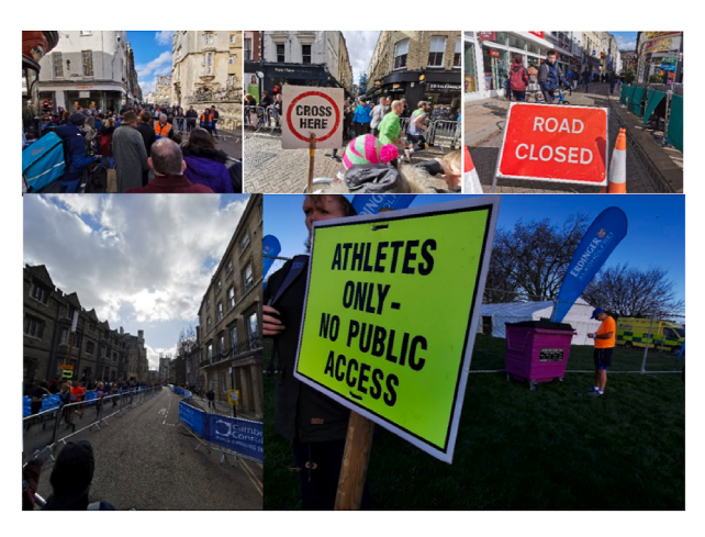
Fig. 3. Collage illustrating how the city of Cambridge became locked down and precluded visitor access to parts of the city.

remained inside the event zone (n = 2,184, 35.2%); and iii) non-local visitors who explored beyond the event zone (n = 469, 7.6%). These results indicate that very few visitors (<8%) engaged with the host city.