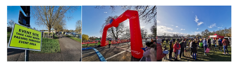
Fig. 2. Collage including race signage (left), start and finish line (middle), and Midsummer Common - the epicentre of the event zone.

The CHM sample of 6212 respondents was segmented into three groups: i) local visitors (n = 3,559, 57.3%); ii) non-local visitors who