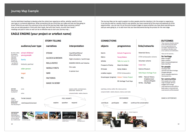
Figure 2: Journey Map © Derby Museums (Derby Museums 2014:12)

In contrast to this algorithmic, data-driven approach, Derby Museums have developed the Journey Map (see figure 2), a mix of graphics and text with prompts which is designed to help identify the ways audiences, narratives and objects or locations will produce experience outputs (learning, reflection, changed attitudes, pleasure). Part of their collaborative experience design methodology (Derby Museums 2014), the Journey Map would seem to be most useful relatively early in the experience design process.