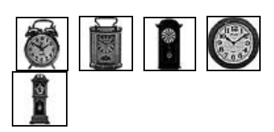
Figure 1: Examples of greyscale images presented to our modular architecture. Each image fits within a 50 by 50 pixel grid such that the principal dimension comes within one pixel of the grid border. These examples depict the 5 subordinate images of the basic level category 'clock' which, in turn, is one of the 7 basic level categories representing furniture.

Our model attempts to remove some of the problems which arise from the use of feature-based input representations by using real pictorial stimuli. The training set comprised a total of 560, 8 bit greyscale images deriving from the 4 superordinate categories of animals, musical instruments, clothing and furniture. Each object was depicted in a canonical perspective and all background detail was removed. Each superordinate category comprised 7 basic-level categories, so animal is subdivided into: bird, snake, spider, fish, deer, mouse and frog, Each basic-level category is further divided into 5 subordinate categories; for example fish are: pike, carp, salmon, herring and bass. These categorical levels reflected the tripartite hierarchy of increasing specificity originally proposed by [Rosch et al. 1976]. Each subordinate was represented by 4 versions of the same exemplar, which varied on dimensions of contrast and left-right inversion. Some example images are displayed in figure 1.