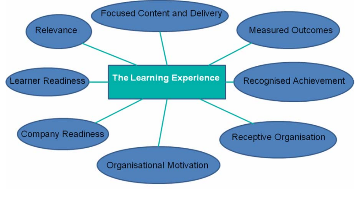
Figure 3. - Learning Experience

Whilst relevance and focus might be self-evident, some deeper explanation is required of the other aspects.