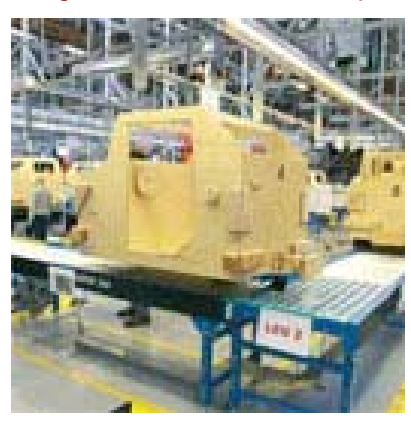
Fig 1. - The SWE Workshop

In common with many other sites across the world, IBC, in 2004, installed a Simulated Work Environment, SWE, with which to train staff in the common practices of their automotive production line. These practices are underpinned by the principles of Lean manufacture and in particular continuous improvement.