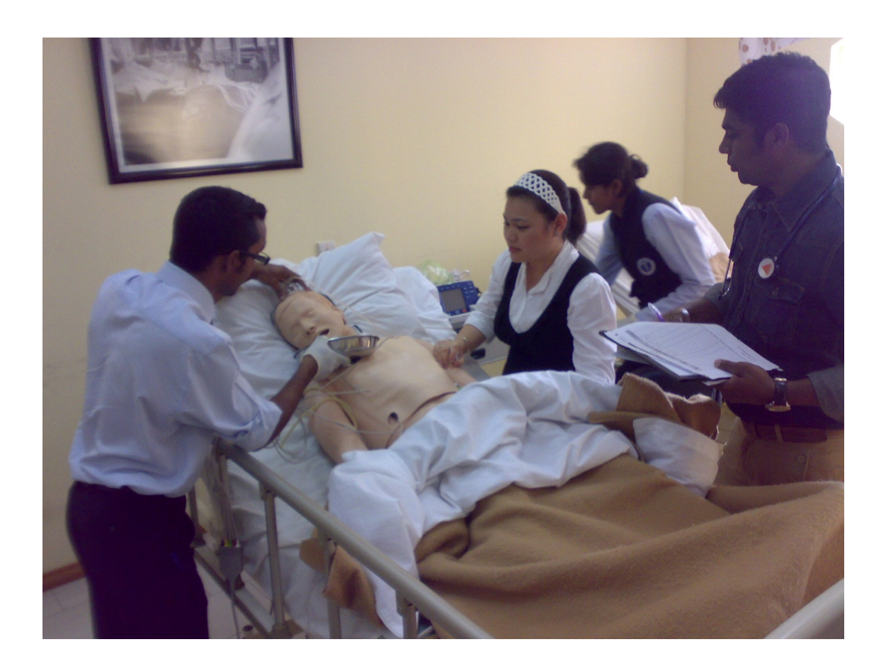
Figure 2: Example of an industry supported course run in Mauritius for medical and nursing

educators, and organised by one of the co-authors of this paper (Alinier et al. 2011).