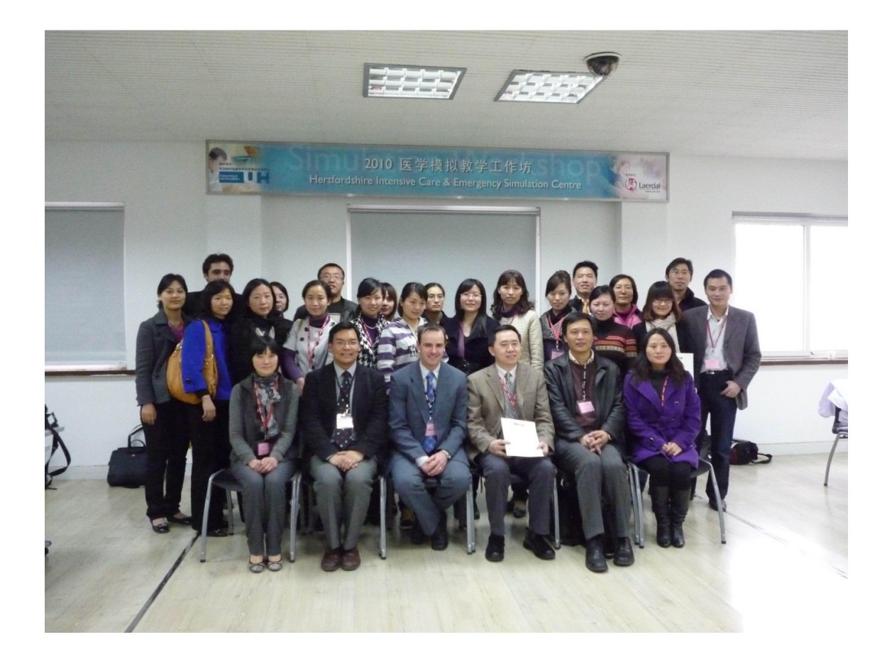
Figure 3: Industry sponsored simulation facilitator workshop held in Hangzhou for representatives from medical and nursing schools in China.