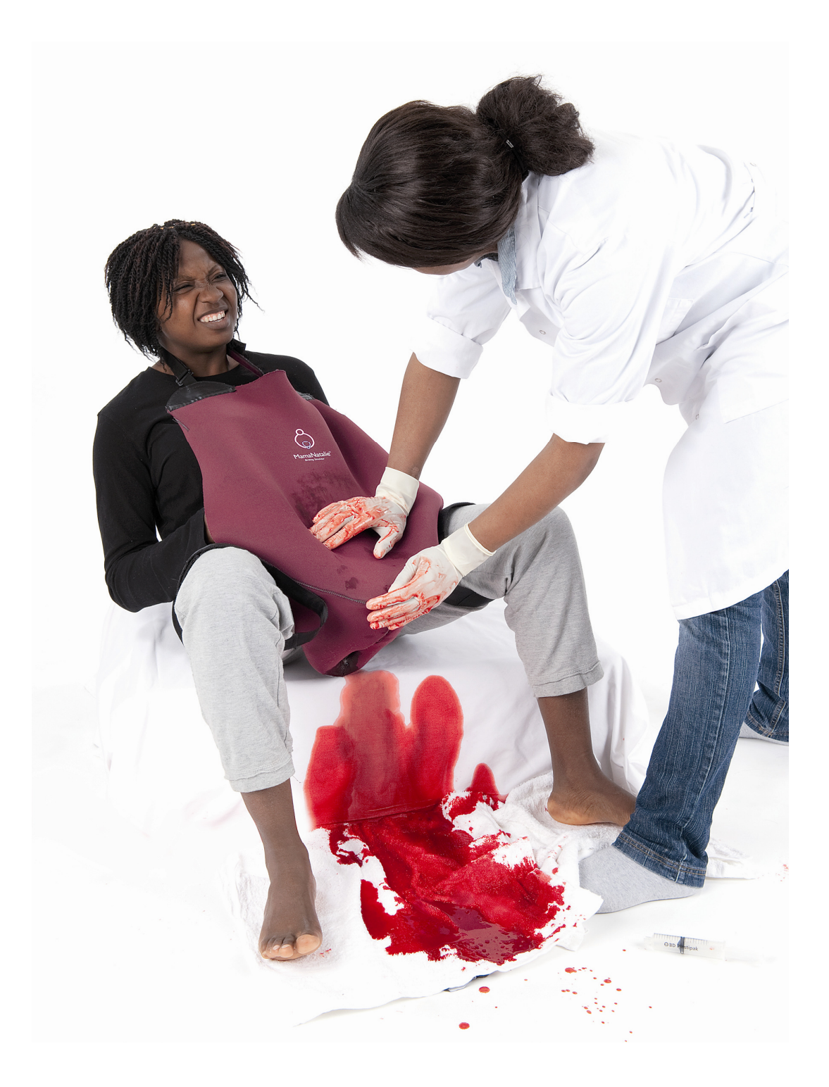
Figure 5: Example of a low-cost simulation device for hybrid simulation, the Laerdal Mama Natalie birthing trainer.