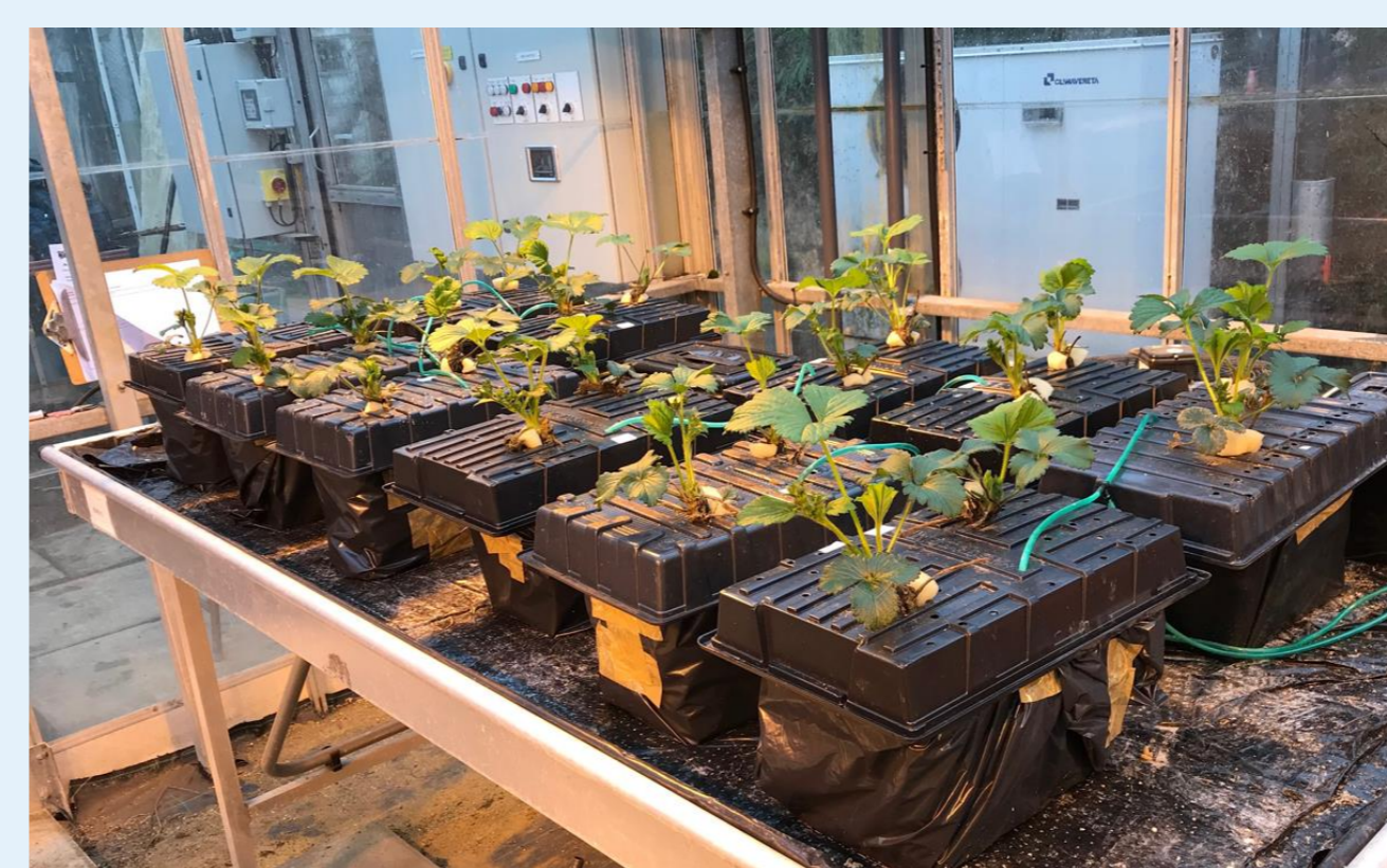
Figure 2: Hydroponic tubs containing strawberry plants in Hoagland's solution on glasshouse bench four weeks after planting (2018).