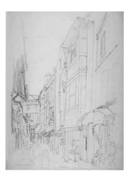
Figure 1.02 Field Lane, c. 1800.

While passers-by provided vital assistance in arresting those suspected of crime, typically they did so at the request of the victims, who normally provided the key prosecution evidence at the subsequent trial. But who was to provide the lead in the arrest and prosecution of those accused of victimless crimes such as sodomy? For the prosecution of this type of crime the English judicial system relied on