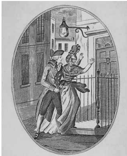
Figure 2.07 ‘Renwick Williams, Commonly Called the Monster’ (1790).

Between May 1788 and June 1790 there were reports of over 50 attacks on women in public by unidentified men wielding sharp implements. Although the details varied, the assaults shared many characteristics. They were generally unprovoked and carried out by men unknown to the victim. The culprit used insulting and threatening language and a sharp object to cut through the victim’s clothes and into her flesh, typically in the thigh or bottom, but sometimes the face. He then lingered, clearly enjoying watching his victim suffer. The instruments, which were often disguised and sometimes designed to cause particularly horrific injuries, included knives hidden in canes or attached to shoes (for use when kicking), sharp pins disguised inside bouquets (which the victim was urged to smell) and claws with several sharp prongs. Some women were also kicked or punched on the breast or head.