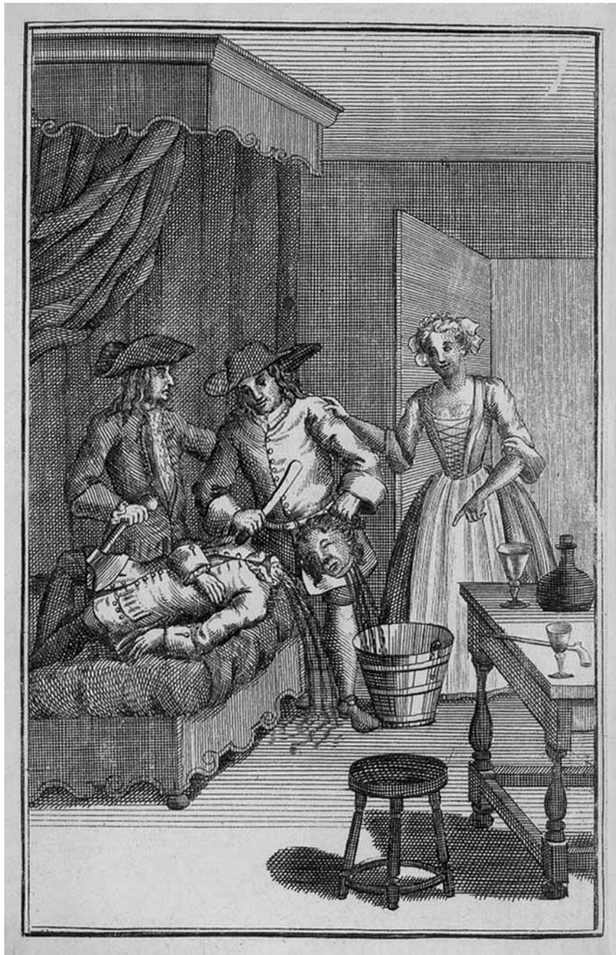
Figure 2.02 Catherine Hayes, Thomas Billings and Thomas Wood Decapitating the Body of John Hayes (1726).