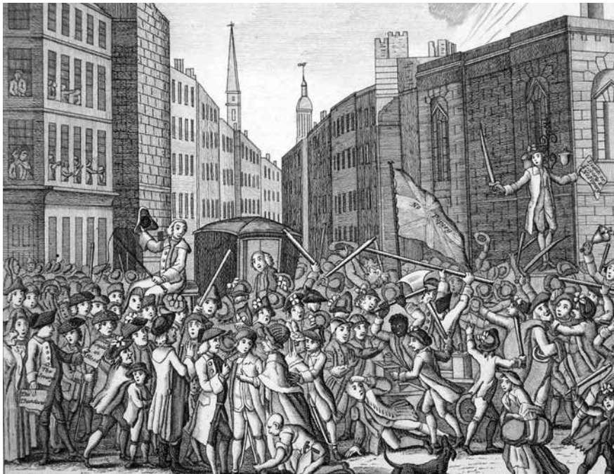
Figure 2.06 'An Exact Representation of the Burning, Plundering and Destruction of Newgate on the Memorable 7th of June 1780' (detail).