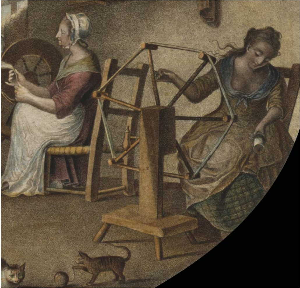
FIG. 3. Reeling linen yarn on a revolving clock reel, Ireland, 1782. Gears inside the box at the top of the pillar connected the reel's axle to a pointer on a clock-like face, visible to the reeler, indicating the number of revolutions. This was the most sophisticated and probably the most expensive form of reel. Detail from William Hincks, 'To the right hon'ble the Earl of Moira, this plate, taken on the spot in the County of Downe, representing spinning, reeling with the clock reel, and boiling the yarn', hand-coloured engraving, 1782.

False and short reeling were activities confined neither to the worsted industry nor to the eighteenth century. Given that the value of yarn varied in all the textile industries according (at least in part) to the fineness to which it was spun, the potential for this kind of deceit existed wherever yarn was the object of a commercial transaction. This was true irrespective of whether that transaction was between the spinner and an