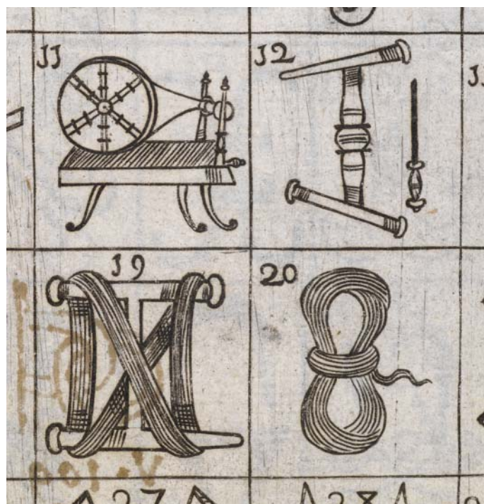
FIG. 2. Reel staffs and reeled yarn, late seventeenth century, printed engraving. 11: a spinning wheel. 12: an empty reel staff (left). 19: a reel staff loaded with a hank or skein of yarn. 20: a hank or skein of yarn removed from the reel. Proof plate (detail) for Randle Holme, The Academy of Armory (Chester: 1688), Book 3, ch. 6. © The British Library Board, Harleian MS 5955, f. 38.

threads (or 560 yards) constituted a hank. The number of such hanks in a pound of yarn provided a measure or 'count' of the fineness of the yarn. The types of yarn required by a Yorkshire manufacturer of shalloons in the late eighteenth century ranged from counts as low as eighteen hanks to the pound to as high as thirty-six hanks to the pound. The rate paid in Yorkshire in the early 1770s for spinning yarn at twenty-four hanks to the pound was approximately 25 per cent higher than that for eighteen hanks to the pound. 23