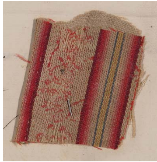
FIG. 5. 'Striped Calimanco', 1759. On top, a calamanco, an all-worsted fabric woven in red, yellow, and brown stripes with a flowered pattern; underneath, a brown linen. The individual coloured yarns from which the calamanco is woven are clearly visible.