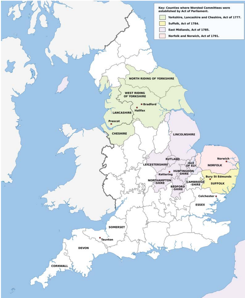
FIG. 1. Principal English worsted spinning counties, c. 1600 to c. 1800. Adapted by the author from Wikipedia, File: English Counties 1851 with Ridings (Online). Available from: en.wikipedia.org/wiki/File:English_counties_1851_with_ridings.svg [Accessed 17 April 2013].