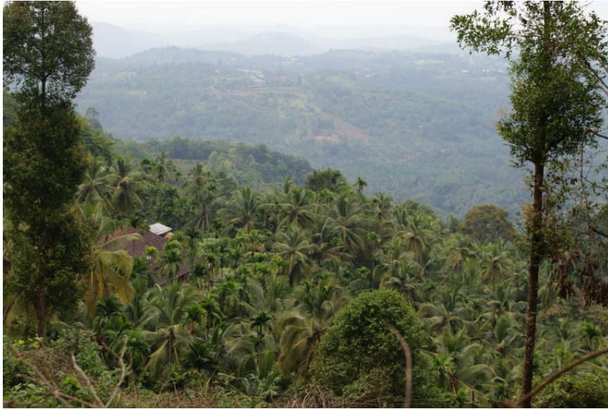
Figure 3: Undulating upland topography of Manila village

Landuse in the region where suranga are mostly found is mainly agricultural with a mixture of forest and privately owned land holdings and farm units. The template for this form of private land tenure is pre-colonial and was indeed copied by the British in the form of Ryot farming (Bhat, 1998). There are six types of forest identified in Malabar; deciduous, tropical evergreen, evergreen shola, scrub shola, mixed deciduous and evergreen forest and finally heavy deciduous forest (Prakash, 1988) Arboriculture is practised by many farmers, tenants and coolies. The main tree crops, in no particular order, are coconut, arecanut, banana, rubber, jacknut, papaya, cashew, vanilla and pepper (CWDRM, 2002). There is some wetland paddy grown in flatter of flattened areas of farmsteads and cocoa. Livestock is rarely seen other than the odd cow or goat used for milk and dairy produce. Besides the water harvesting techniques already outlined farmers may also practice contour bunding, check dams, contour trenches, mulching, and cover cropping. Additional forms of irrigation include drip irrigation, spray irrigation, basin irrigation and pitcher irrigation. Intercropping is typically practised and will include clove, nutmeg, mango, plantains, cocoa, arecanut, pepper and fruit trees. Agroforestry may also be practised and include Jack tree, Anjalee, Phyllanthus Emblica, Nhaval, Mango, Mahogany, Sandal, Garcinia, Neem and Tamarind.