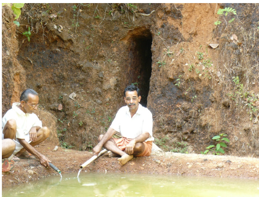
Figure 3: A suranga entrance with piped supply into a farm pond (Source: Shree Padre, 2008).

in Manila has provided some financial help for making a suranga to a family. Govinda Bhat a farmer in the village states that "For a 50 kolu suranga, we need Rs.15,000 as per present wage rate" (Padre, 2008). This survey included a total of 95 suranga from a grand total of around 300 suranga in the village. The practice of constructing multiple suranga on land holdings is common. The suranga in Manila are generally short ranging in length between three and 250 metres with an average length of 40-50 metres. There is a second type of suranga that is constructed horizontally at the bottom of a dug well or concrete well. These are classically harder to survey and so their dimensions are less well known (Kokkal, 2002). The flow of water is often pooled just before the entrance by building a small earthen dam. The water is then conveyed via a small diameter plastic pipe either into a farm pond or directly into an underground irrigation network ( Figure 3 ).