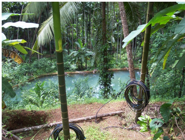
Figure 4: Combination drip/mister irrigation hoses with a farm pond in the background

Distribution of water from suranga, farm ponds or borewell onto crops is either by hand/bucket, inundation, hose, drip, fogger or sprinkler system ( Figure 4 ). In many locations of Manila village there is a large enough hydraulic head between the suranga/farm pond and the irrigated crop to produce sufficient pressure for spray irrigation and misters without the use of pumps.