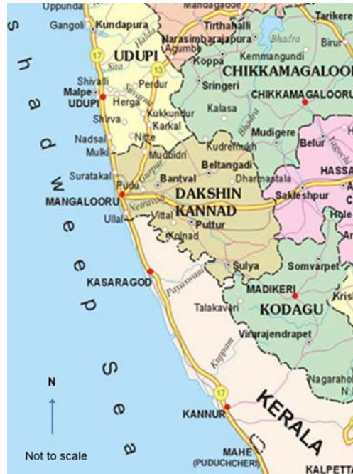
Figure 1: The Dakshin Kannada study site

periods of water scarcity. These water harvesting systems are often used in conjunction with suranga.