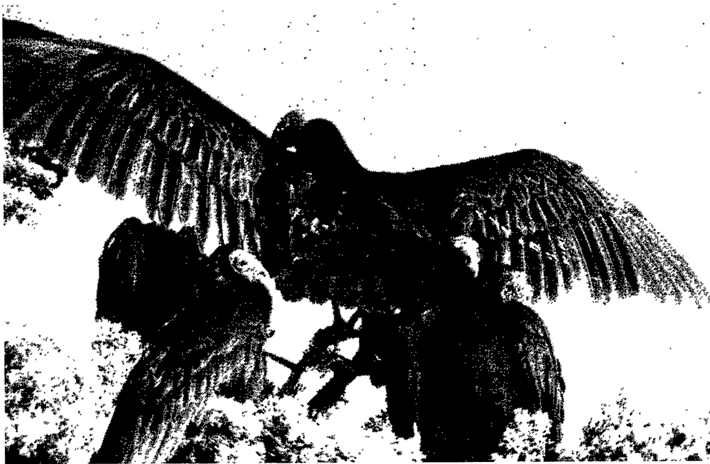
Turkey vultures, Socorro, NM, 29 April 1994