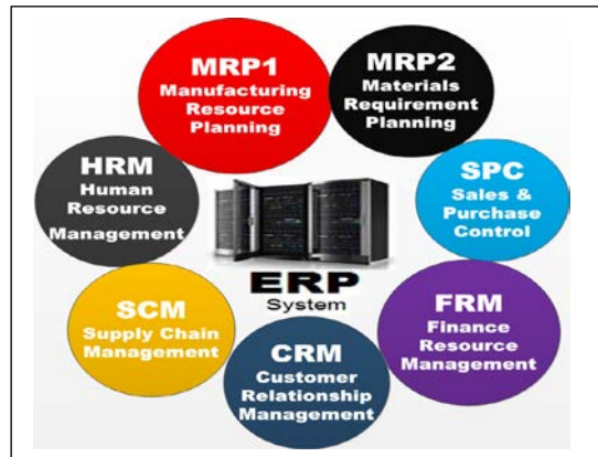
Figure 1: ERP - A centralised database system

single system within a department; for example payroll systems within an organisation were usually the first processes to be computerised. Systems have now progressed to organisations having large centralised databases which can support multiple-users. Figure 1 depicts an ERP system model.