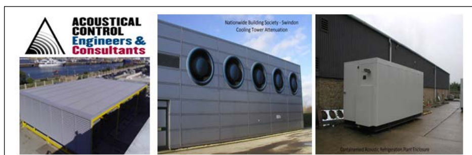
Figure 2: Weather Louvres, Cooling Tower Attenuation & Acoustic Refrigeration Plant Enclosure.

Acoustical Control Engineers (ACE) and Acoustical Control Consultants (ACC) are both 'small and medium sized enterprises' (SMEs) based in Cambridgeshire, UK. ACE provides engineered solutions to noise and vibration problems while ACC provides acoustic consultancy solutions. ACE and ACC's 25 personnel analyse and solve a wide range of acoustic problems and/ or design, manufacture and install noise and vibration control solutions to these acoustic problems. The projects undertaken include acoustic enclosures for supermarket refrigeration plant and for generators used in many situations, together with other more diverse applications such as controlling noise in the workplace, defending a kennels in Court and even controlling noise on a luxury boat. Although distinct companies they are a tightly integrated family run business and it is important that information can be shared efficiently between the two organisations particularly because many projects have both engineering and consultancy aspects to them. Figure 2 below shows some of ACE products.