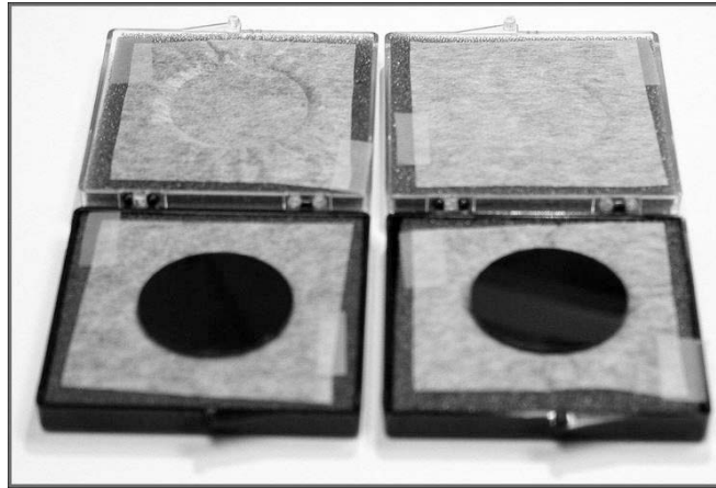
Figure 2. Completed half wave retarders

beam is incident on the camera mirror M3, which images I1 onto the detector array. All optical components and associated mechanisms are attached to an optical bench. The optics and mechanisms are distributed on either side of the bench with a fold mirror to divert the beam through the bench.