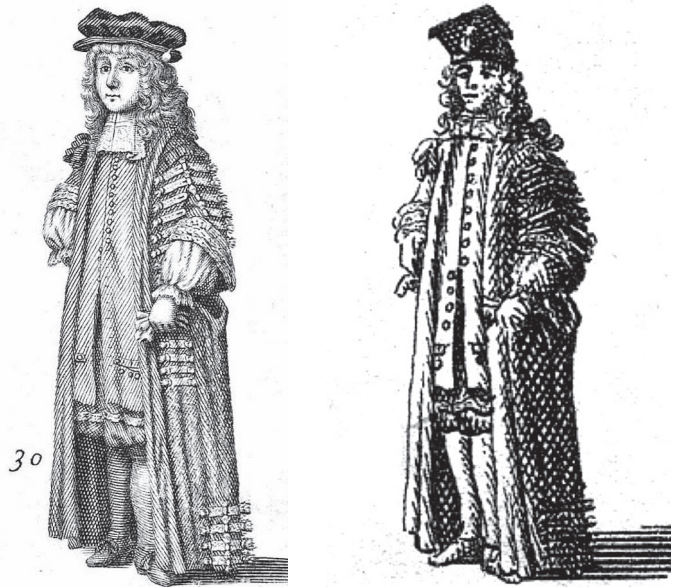
FIG. 3 Nobleman from Loggan 1675 (left), van der Aa 1707 (right).

soever presume to wear a Square Capp, but onely those who are allowed by Statute. 9