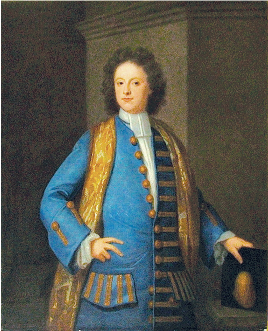
FIG. 1 James Cecil, Fifth Earl of Salisbury, who lived 1691–1728.