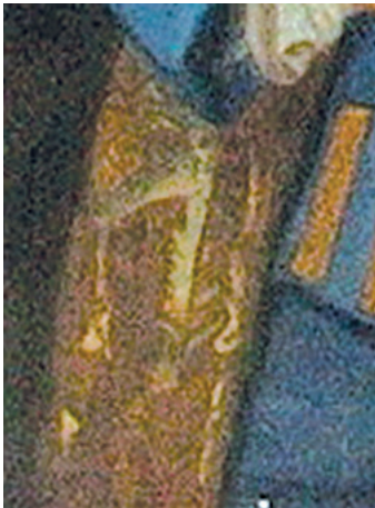
FIG. 4 Details of Fig. 1.