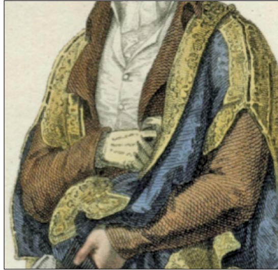
FIG. 8 Nobleman in full dress: detail from Uwins 1813.

Ambient fashion often becomes incorporated into academic dress de facto , and is formally accepted—and regulated—only some time later. But there may be a considerable delay—sometimes many decades—between the emergence of a lay fashion in the outside world, and the appearance of the first university sanction for it; 25 in such cases it is interesting to enquire when the feature was first tacitly adopted and used in academic dress. If our conjecture is correct, this portrait of the Fifth Earl constitutes a relatively early instance of the academic use of hook and eye, as well as a very early sighting of a gold tassel for a square cap.