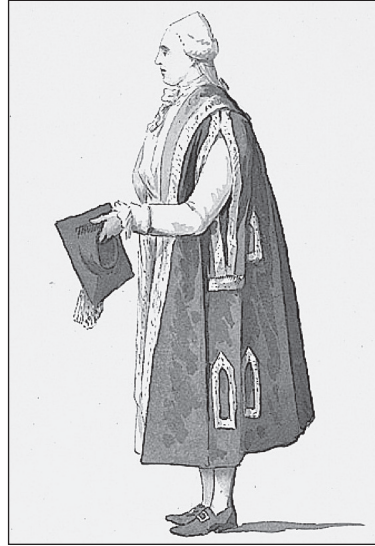
FIG. 7 (Below) Roberts 1792 : Nobleman (left), Baronet (right) in full dress.