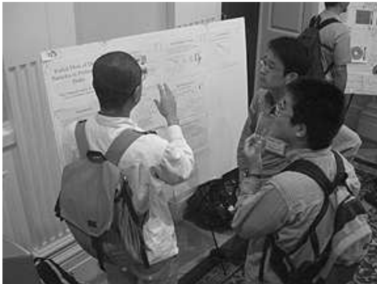
Discussing the Posters