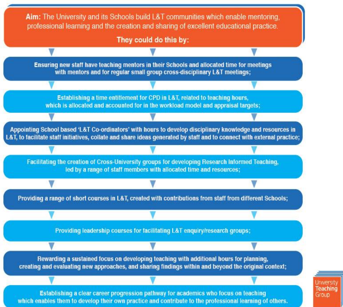
Figure 2. Identified actions to promote professional learning in teaching