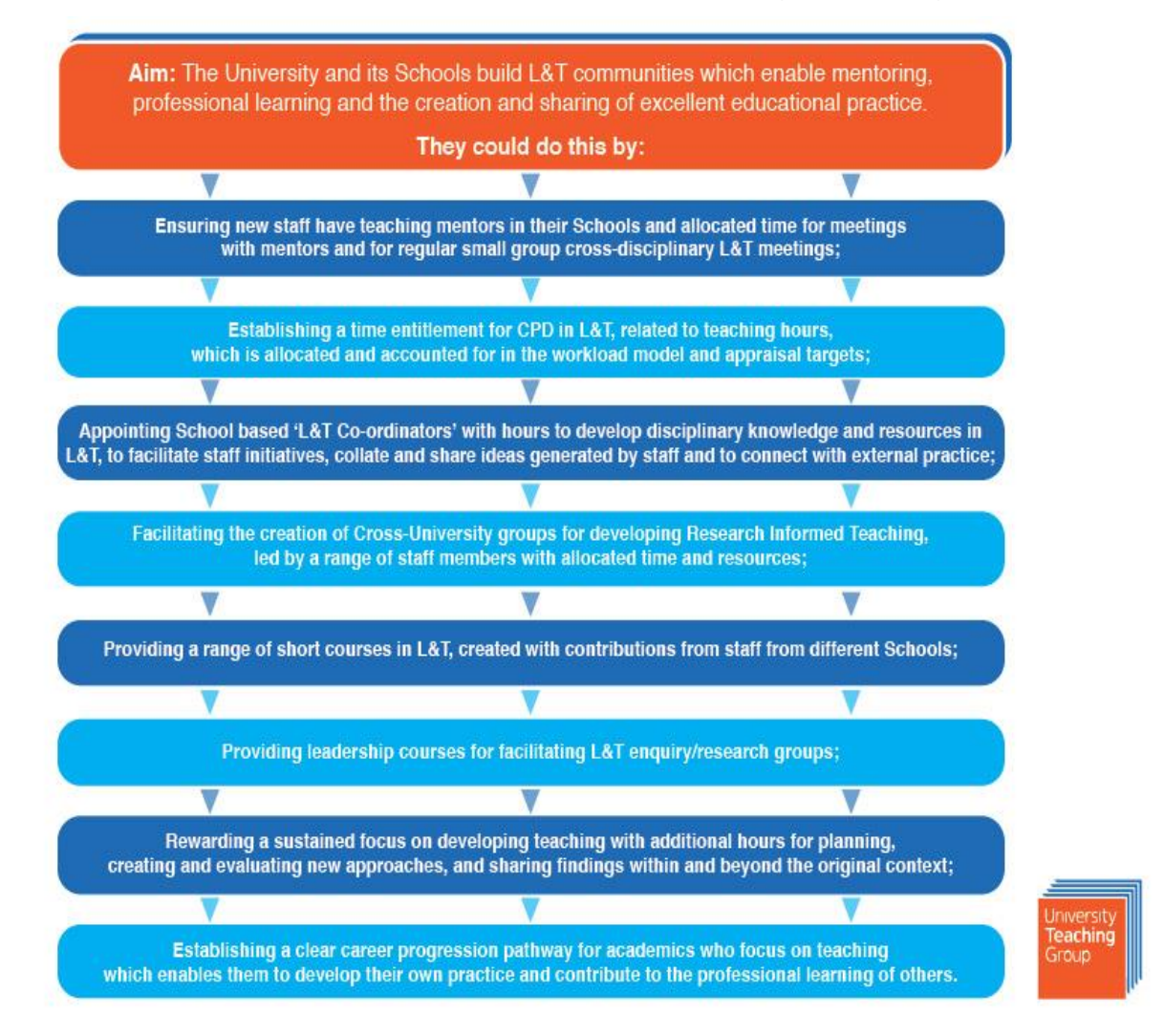
Figure 2. Identified actions to promote professional learning in teaching