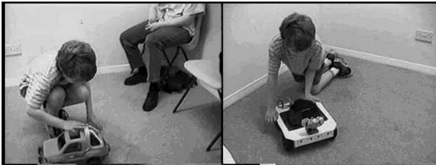
Fig. 1. The comparative study that investigated quantitative differences in robot-human interactions. A child with autism playing with a non-interactive toy truck (left) and the mobile robot (right).

guiding and structuring these interactions in a therapeutically beneficial way. Three different roles of the robot are investigated (our current research focuses on the first two roles).