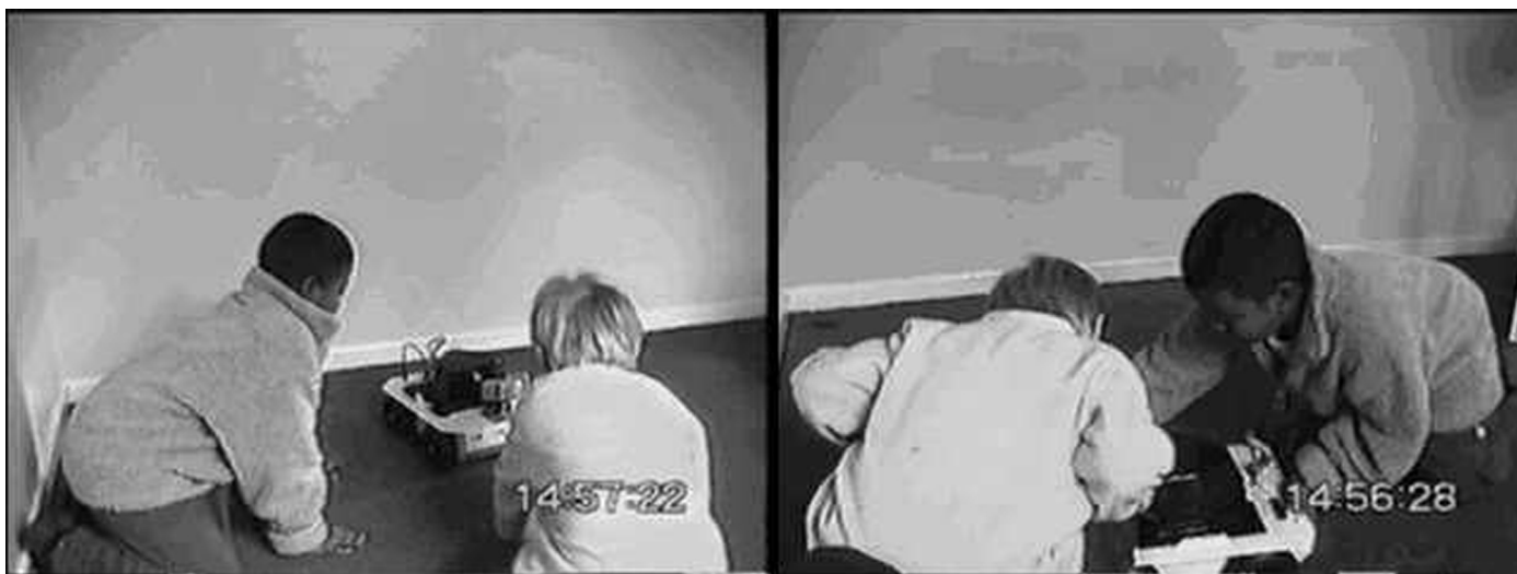
Fig. 2. The two-child-one-robot case study: two children with autism are shown playing with the robot. The trials investigated the role of the mobile robot as a serial mediator.