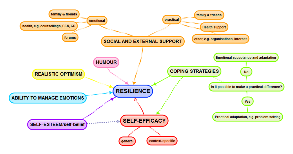
Figure 2: Resilience attributes (attributes indicated in capitals)

Based on these findings it was decided, that for the purposes of the intervention and for a coherent and simplified approach to enhancing resilience and self-efficacy, the attributes could be clustered into four main themes: