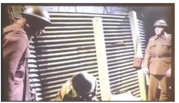
Connected Communities Festival: Performing the First World

War July 25, 2014 In "Co-ordinating Centres"