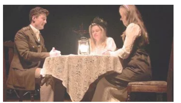
Revisiting war-time drama: The case of J.M. Barrie's A Well-Remembered Voice (1918) September 29, 2016 Similar post