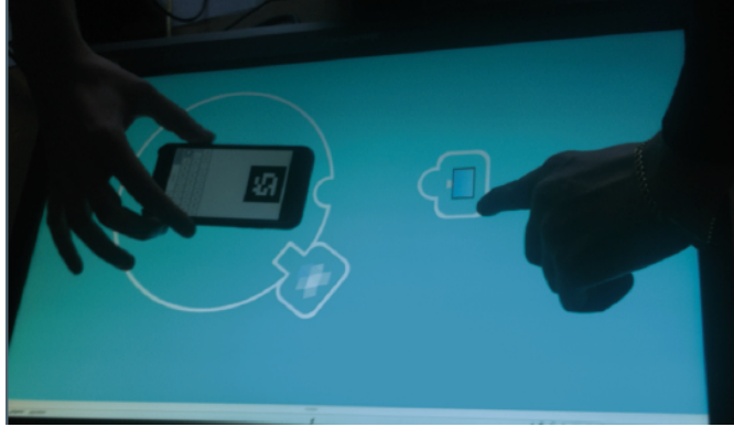
Fig. 2. Block-oriented programming with tangibles. Users are assigning digital properties and functionalities to a smartphone assembling blocks instead of by programming.

Those are just few examples of the emerging platforms providing capabilities that are compliant with our definition of proto-tools and that can be exploited to design and implement high-fidelity prototypes in fictional design scenarios.