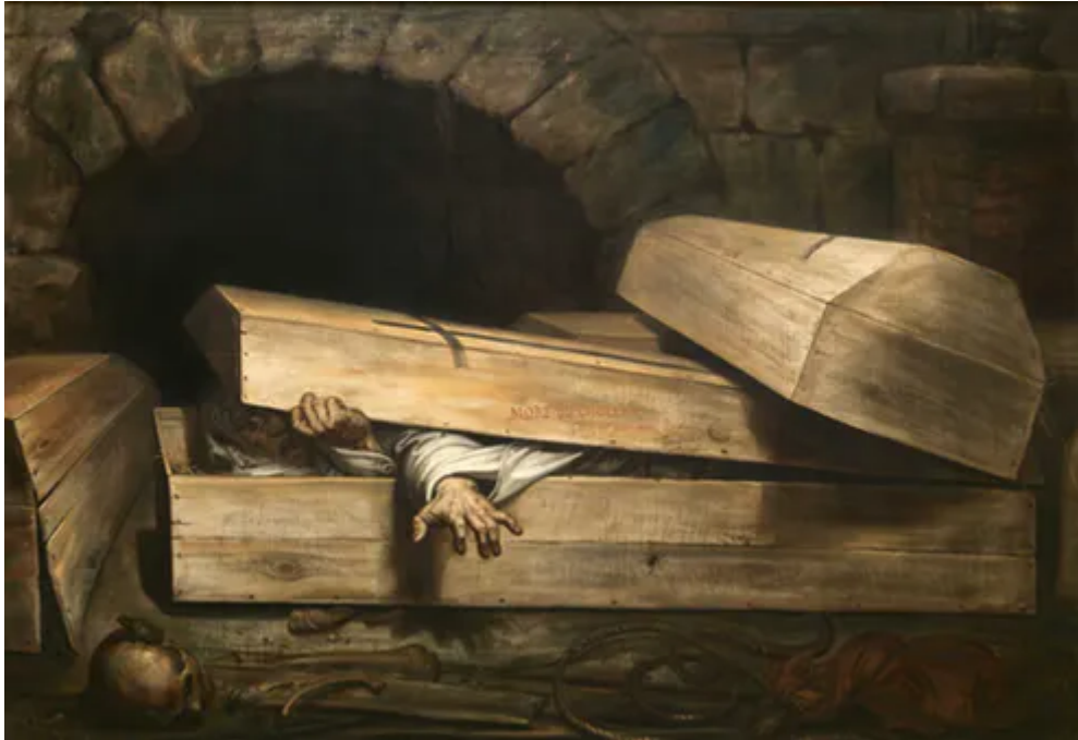
The Premature Burial. Antoine Wiertz (1854)