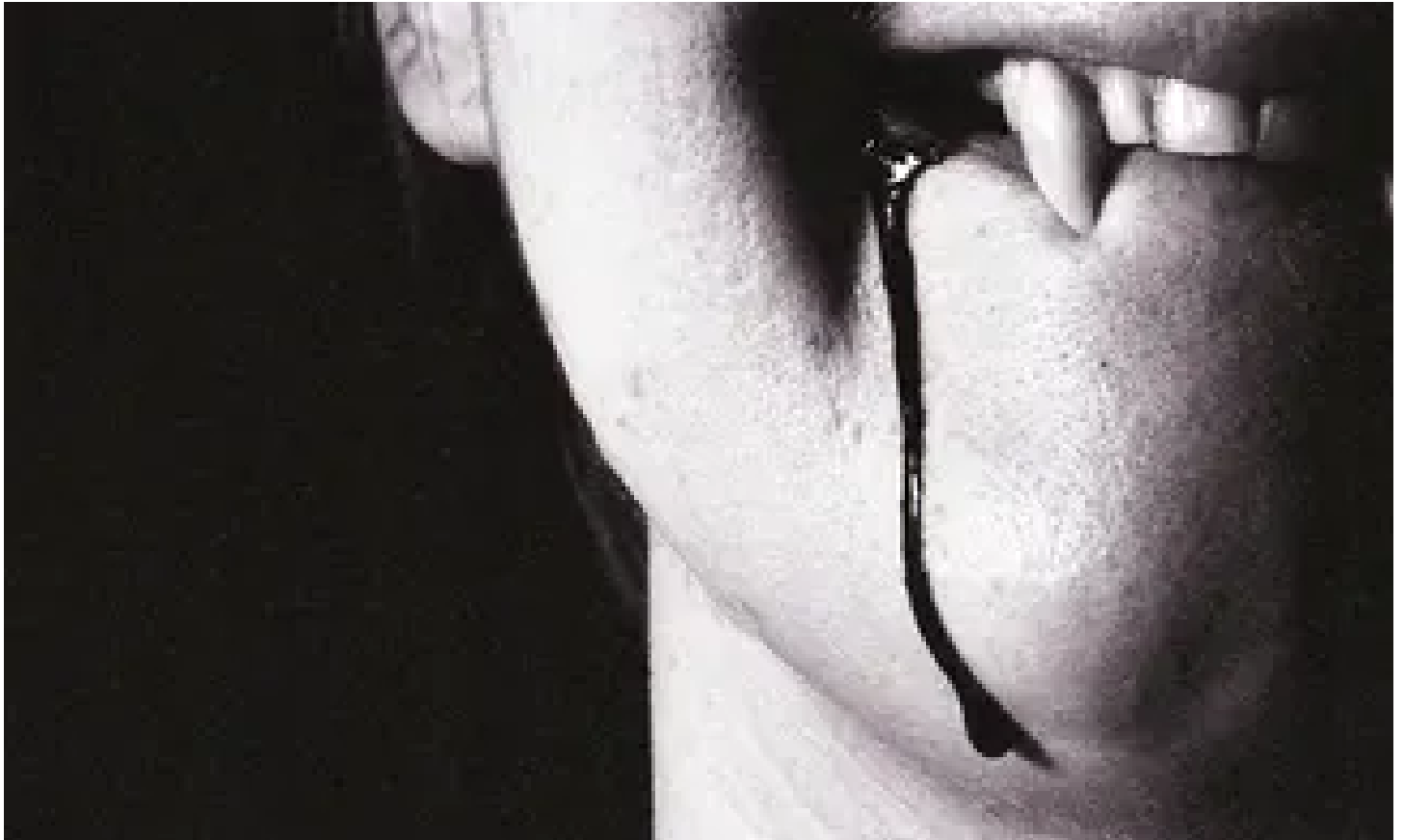
What they do in the shadows: my encounters with the real vampires of New Orleans