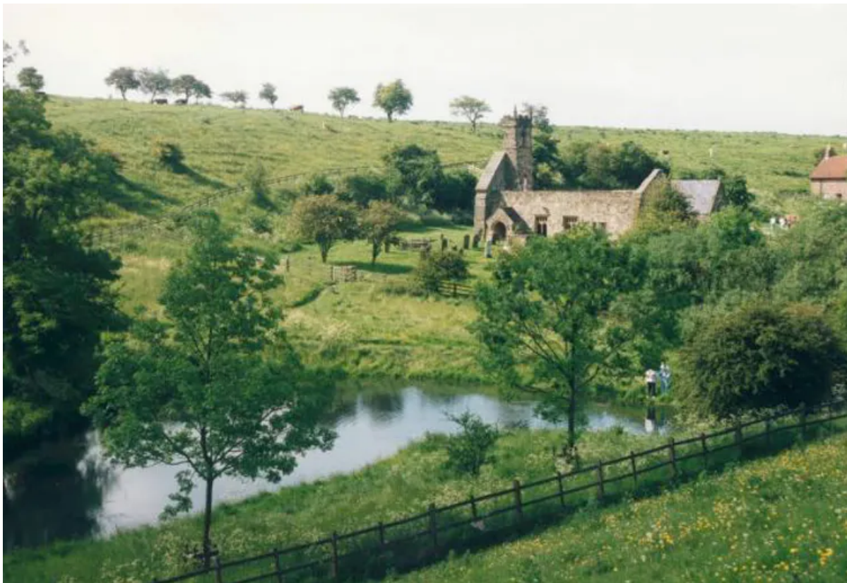
'Vampire graves' have been found at the abandoned village of Wharram Percy in Yorkshire.

The Buckinghamshire revenant did not have a “vampire” burial – but such practices are evidence of a longstanding belief in vampires in Britain. Astonishingly, the medieval remains of the what are thought to be the first English vampires have been found in the Yorkshire village of Wharram Percy. The bones of over 100 “vampire” corpses have now been uncovered buried deep in village pits. The bones were excavated more than half a century ago and date back to before the 14th century. They were at first thought to be the result of cannibalism during a famine or a massacre in the village but on further inspection in 2017 the burned and broken skeletons were linked instead to deliberate mutilations perpetrated to prevent the dead returning to harm the living – beliefs common in folklore at the time.