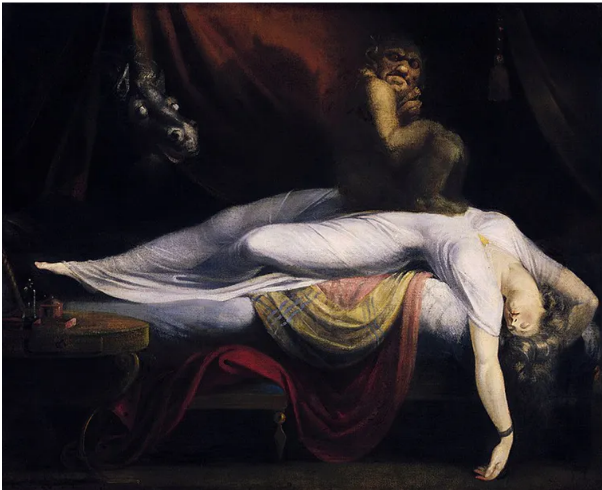
The Nightmare. John Henry Fuseli (1781)