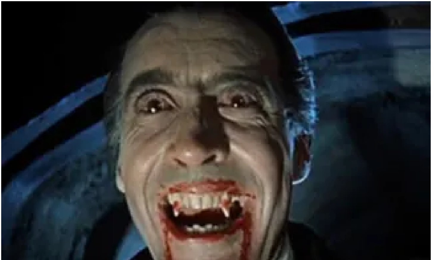
Fangs for the memories: death of Christopher Lee draws a veil over golden years of horror