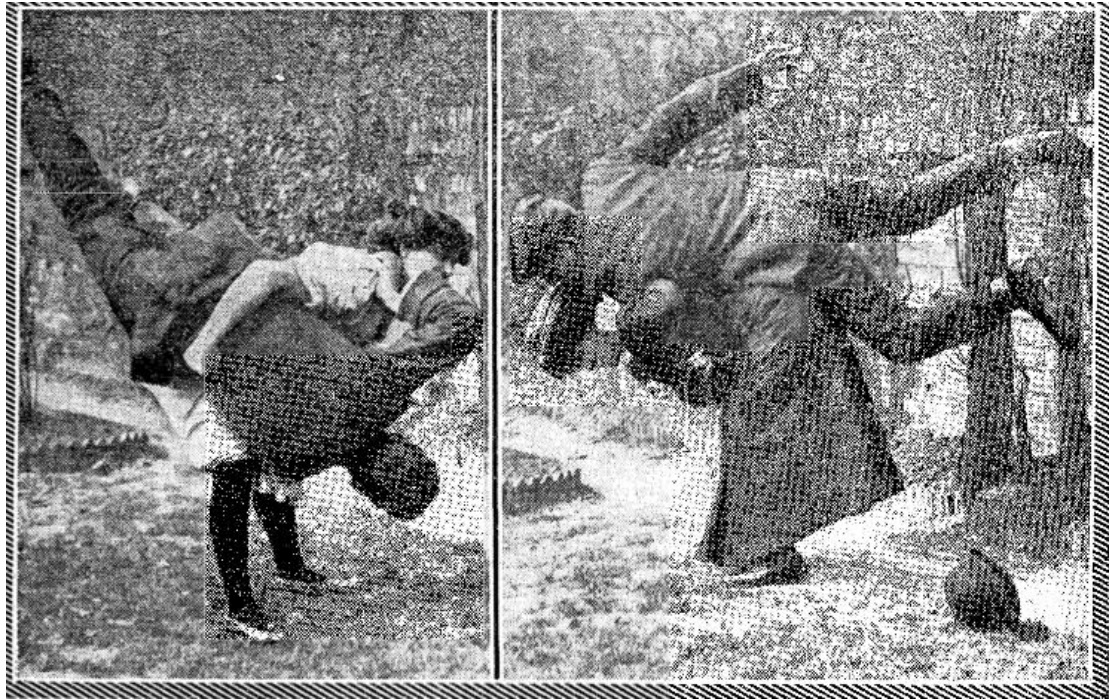
Fig. 2: ‘Suffragettes to Learn the Art of Jujutsu’, Daily Mirror , 13 April 1909, 9.

Writing in Health and Strength in 1910, Garrud vehemently reiterated the claim that jūjutsu was being taught to protect women from ‘the attack of a ruffian’ and not ‘the man in blue’. 64 This was a point she took to theatrical lengths the following year with her play entitled ‘Ju-Jutsu as a Husband-Tamer.’ Again Health and Strength was used as a media platform, with the 8 April edition running a small pictorial article on the play.