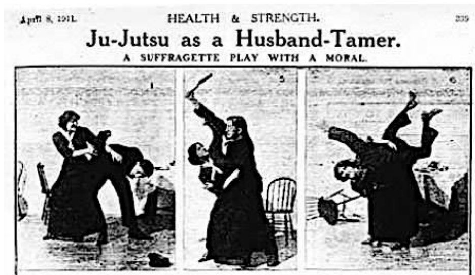
Fig. 3: ‘Ju-Jutsu as a Husband-Tamer: A Suffragette Play with a Moral’, Health and Strength , 8 April 1911, 339.

Writing in Health and Strength in 1910, Garrud vehemently reiterated the claim that jūjutsu was being taught to protect women from ‘the attack of a ruffian’ and not ‘the man in blue’. 64 This was a point she took to theatrical lengths the following year with her play entitled ‘Ju-Jutsu as a Husband-Tamer.’ Again Health and Strength was used as a media platform, with the 8 April edition running a small pictorial article on the play.