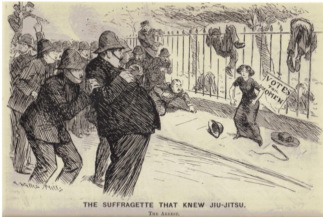
Fig. 4: 'The Suffragette that Knew Jiu-Jitsu. The Arrest', Punch Magazine , 7 July 1910, 9.

captured the media's attention. Not only that, she proved adept at manipulating this interest for her own purposes.