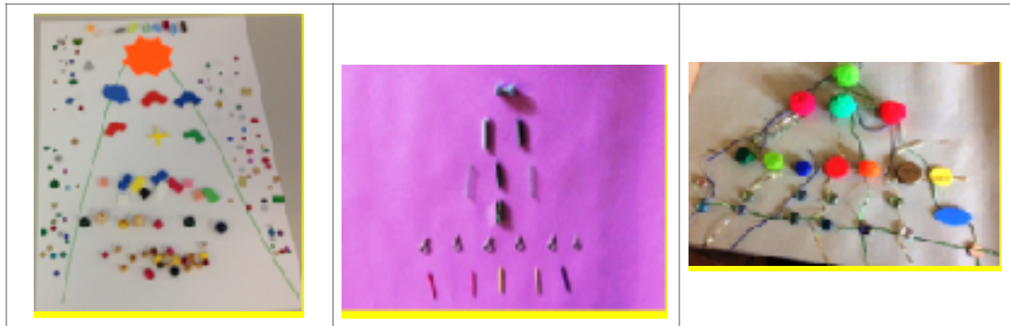
Figure 1: Images of hierarchy