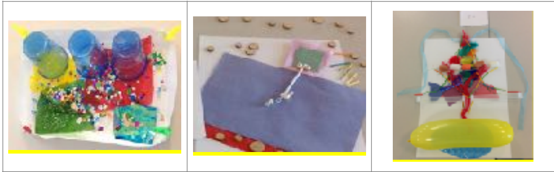
Figure 4: Leadership as a social process (1)