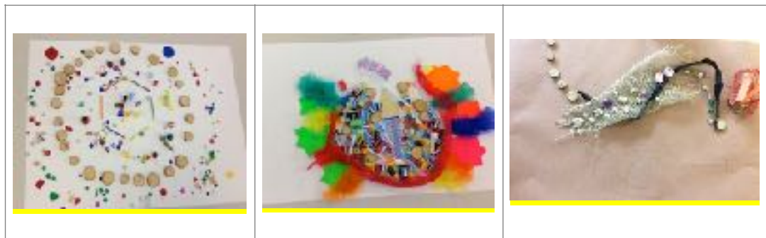
Figure 2: Images of holarchy