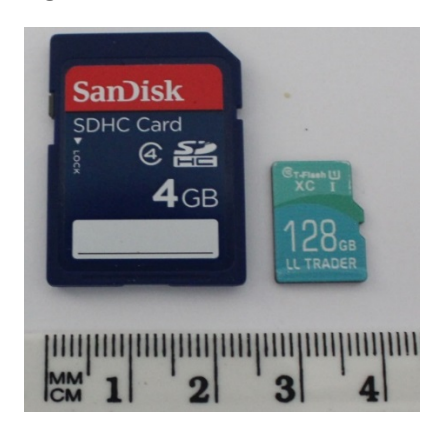
Figure 1 - SD and Micro SD cards

In addition to their use in a whole range of mobile devices, the emergence of the large capacity memory cards have now reached the size that makes them a viable option for the backing up of the contents of a user's personal computer. The storage capacity of a Micro SD card (up to 512GB) is now equal to or greater than the capacity of most home use laptop computers. This gives the users the benefit of being able to back up and carry their sensitive or important data with them at all times, without the need for a bulky and weighty external disk drive. At the present time the two main types of device in which memory cards appear to have been used are smart phones and tablet computers, although during this research examples were also found of them being used in SatNav systems, dashcams and drones. While the Apple iphone and ipad do not have slots to allow for the use of memory cards, almost all other mobile devices do. The market share of the different operating systems in the UK in March 2018 was the Apple iOS at 53.3%, devices with the Android operating system at 44.4% and other operating systems (Windows and Blackberry) at a combined 1.2 percent (Statistica, 2018). Table 1 below shows the breakdown of operating systems that could be identified during the study.