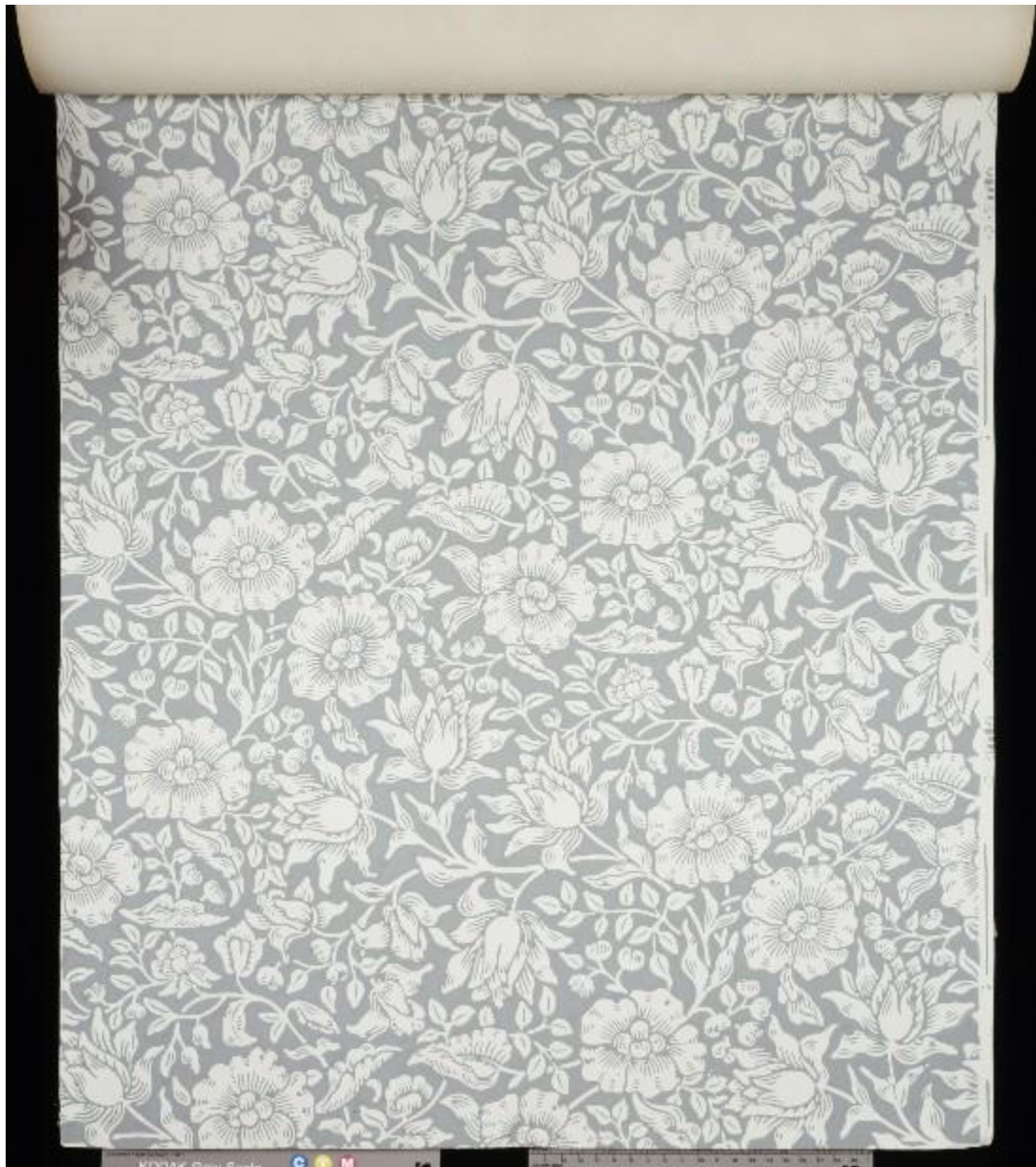
Figure 6: Kate Faulkner, Mallow, woodblock printed wallpaper, 1879, E.811-1915, copyright Victoria and Albert Museum, London.

principles of the Arts and Crafts movement, the wallpaper is woodblock, rather than machine printed. Mallow was a mid-range paper, costing around 20 shillings per roll in 1890 (Harvey and Press 174). Its busy aesthetic is a sharp contrast to the pale, soft, and relatively simple styles hung on the walls during the preceding eighty years. This busy, quintessentially Victorian aesthetic continued through the remainder of the nineteenth-century papers, and indicates a sense of conformity and conservatism in the domestic identity crafted by these students.