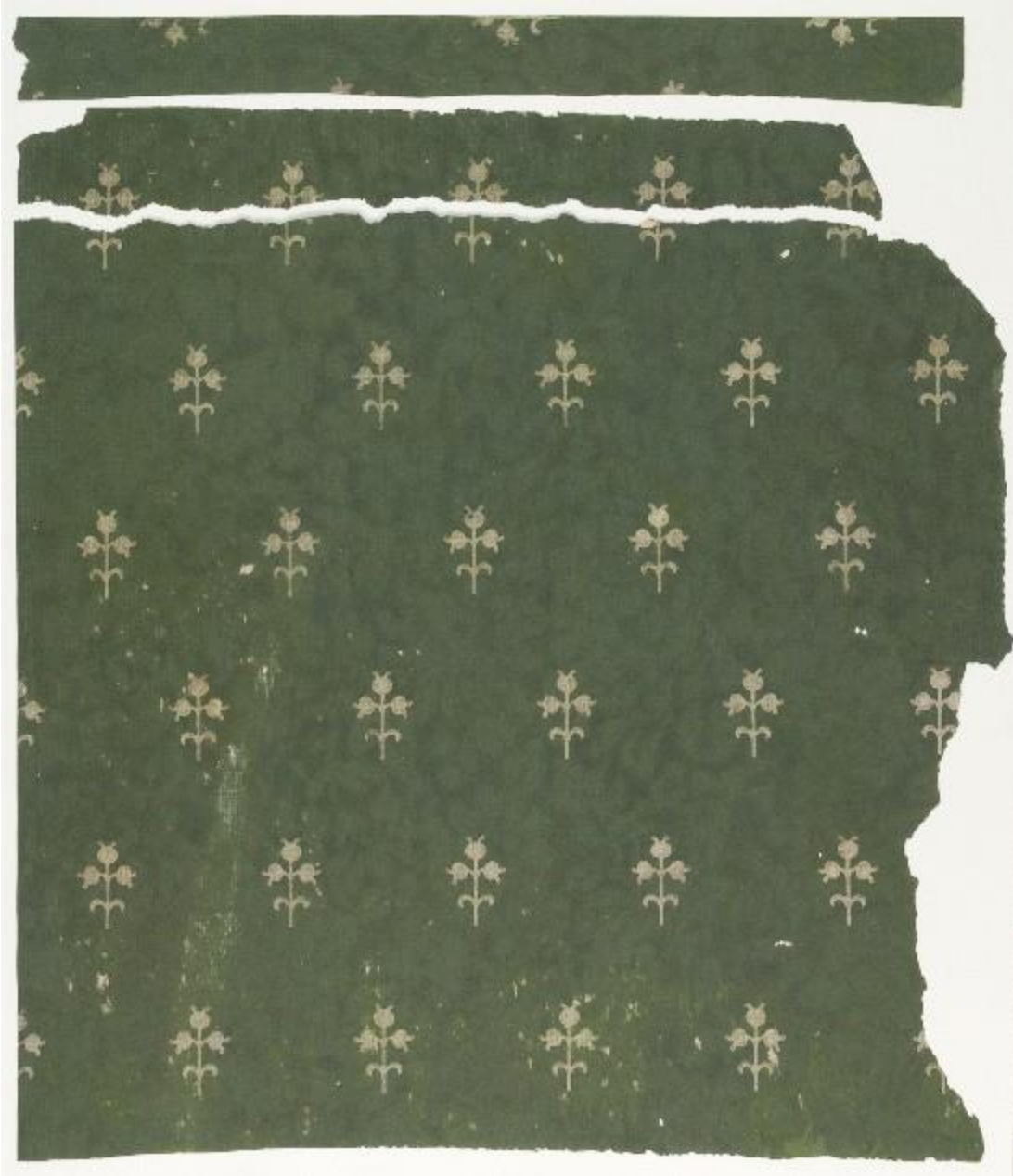
Figure 10: Sixth layer of the wallpaper sandwich, 1905, Museum of Domestic Design and Architecture, BADA 4869.