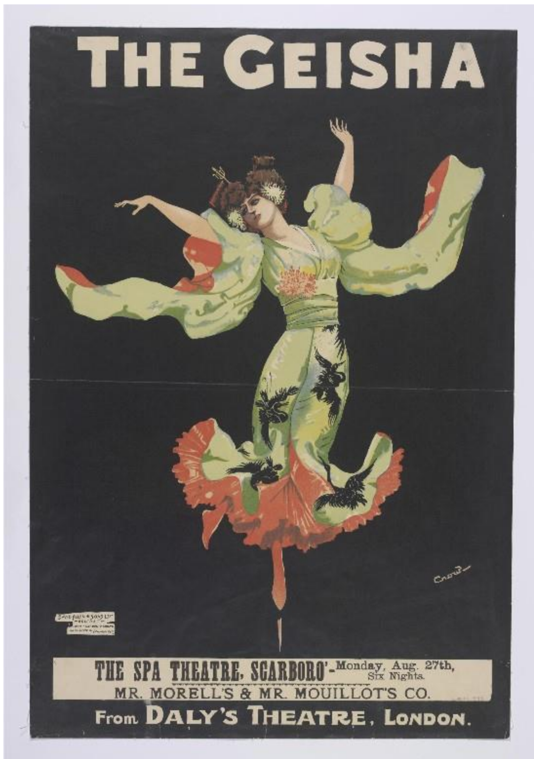
Figure 13: Poster for The Geisha, 1896, colour lithograph, David Allen and Sons, S.966-1995, copyright Victoria and Albert Museum, London.