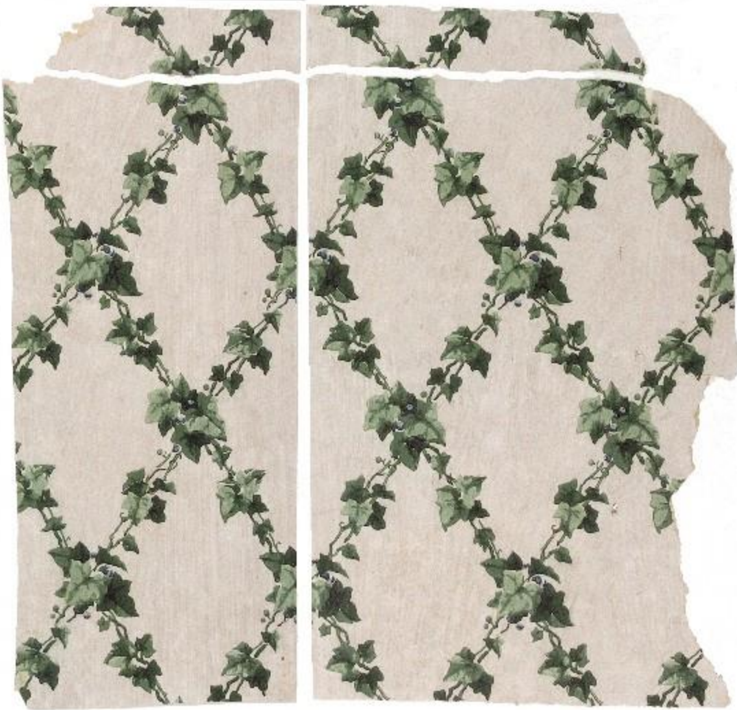
Figure 11: Seventh layer of the wallpaper sandwich, 1905-1910, Museum of Domestic Design and Architecture, BADA 4869.