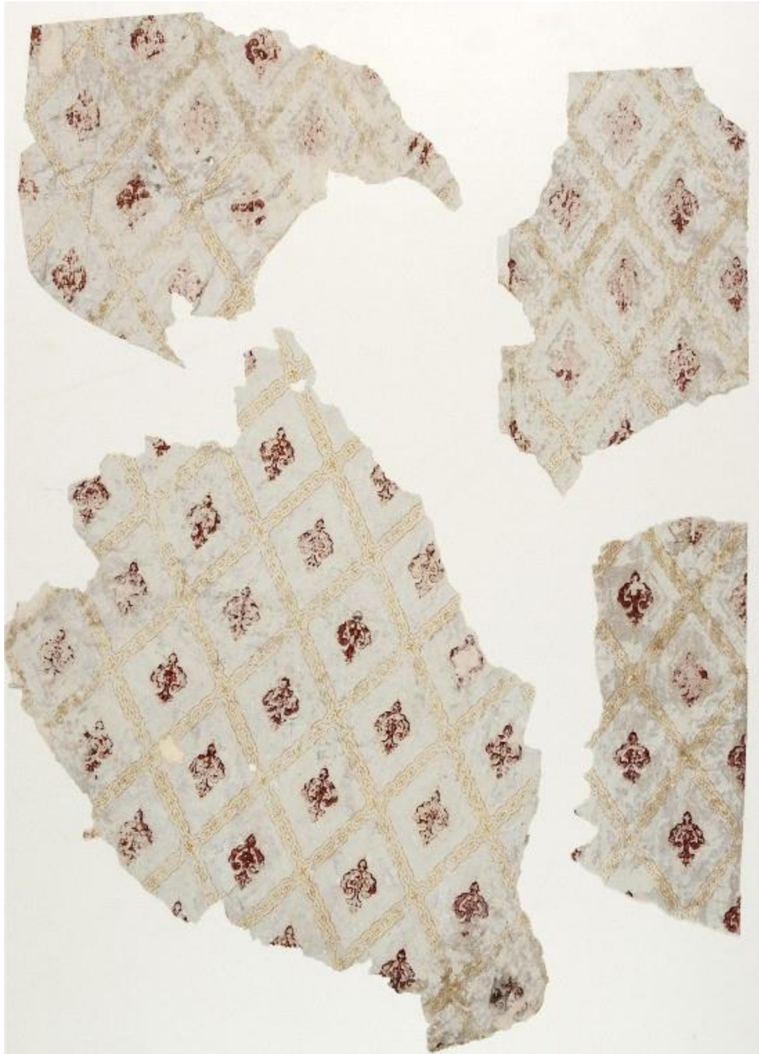
Fig. 3. Second layer of the wallpaper sandwich, 1850, Museum of Domestic Design and Architecture, BADA 4869.