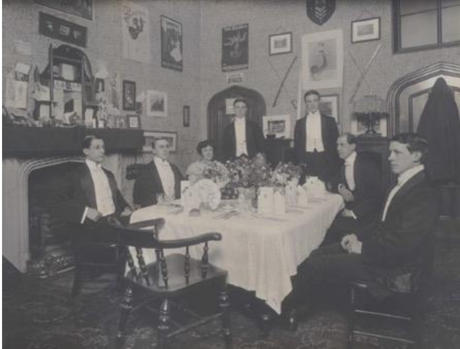
Figure 12: Photograph of an unidentified room New Court, St John's College, University of Cambridge, 1905.

<24>A more formal photograph of an unidentified room, also in New Court, St John's College, contextualises these early twentieth-century papers. A similar coalescence of personal, college, and family identities is evident, but the influence of popular culture is heightened. Over the mantel—still the focal point for the accumulation and display of smaller cards, photographs and ephemera—the family photographs and mementos are interspersed with caricatures and cartoons. Three posters - for the Gay Parisienne , A Country Girl , and The Geisha are also displayed prominently, although unframed. A copy of the poster for The Geisha , displayed above the door, is also held in the collection of the Victoria and Albert Museum (fig. 13). This was a musical comedy, which opened in London in 1896 and continued to be popular until the 1930s (Richards 266). Interest in theatrical pursuits, and the access they provided to their female performers, was viewed by moralists as highly dangerous for the young men of Oxford and Cambridge (Deslandes 66). However, theatre and music hall productions were enduringly popular, and many undergraduate periodicals contained “theatre notes”.