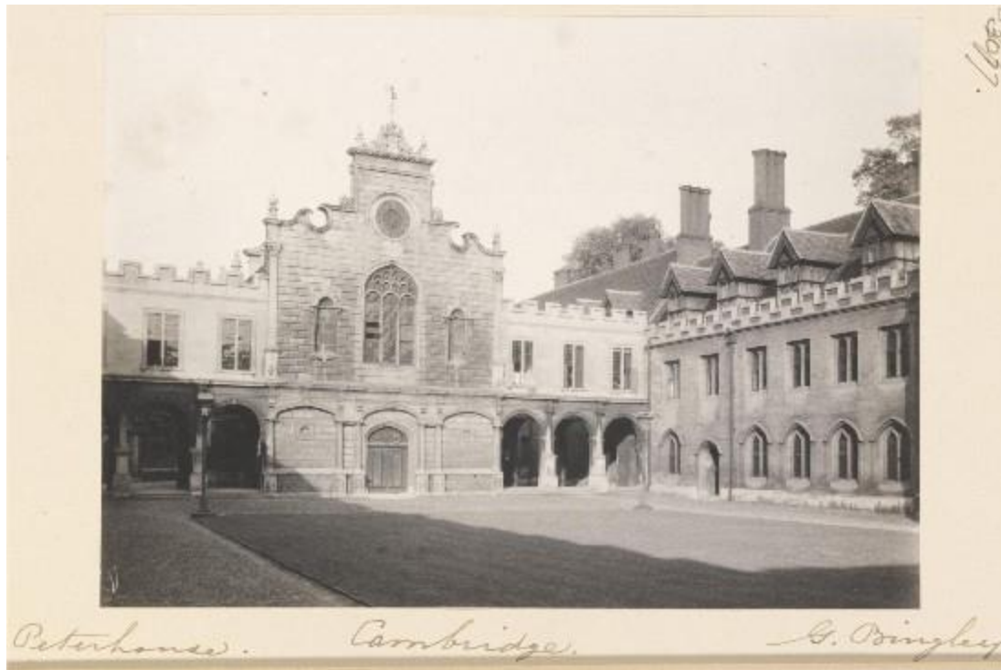
Figure 1: Photograph of Peterhouse College, University of Cambridge, 1902, E.1828-2000