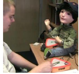
Figure 2 A screen shot from the experiments showing a person playing a drumming game with Kaspar.

higher number of beats than the other models. Ideally, if the human beats long sequences, this model would reach very high values so we put a maximum time limitation (both interactants cannot play longer than 10 seconds per turn). Unlike modell , model2 has a triangular shape which has the threshold as an upper bound. Since we have a probabilistic approach we can have values smaller than the threshold. In fact, we expect this model to give the least play time and lowest resulting number of beats for human participants, so we foresee that the model would not be as popular as the other two models among the participants. The last condition is model3 , a hyperbolic model, which cannot be bounded by thresholds. It reaches high values (close to 1) very fast compared to model2 . Therefore we predict that it would give more play time and enables to play more beats than model2 . Also, in our simulations we noticed that it could enable ‘good games’ (i.e. with a very low number of overlaps and conflicts between the human’s and robot’s drumming) if we played short sequences, but since the model is not bounded by thresholds, it ‘reacts’ to the human but does not exactly ‘imitate’ the games, which might not be accepted by participants.