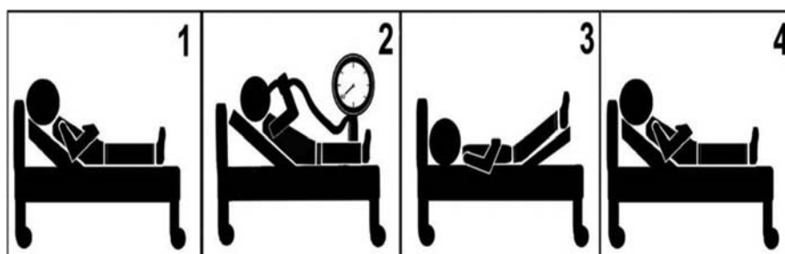
Figure 1. Modified Valsalva maneuver technique

Step 3: Once the 40 mm Hg intrathoracic pressure is achieved, then reposition the patient supine and passively raise the patient's legs to 45 degrees for 15 seconds.