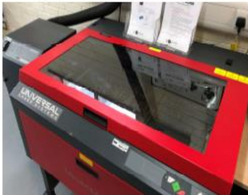
Figure 3: QR code in module documents.