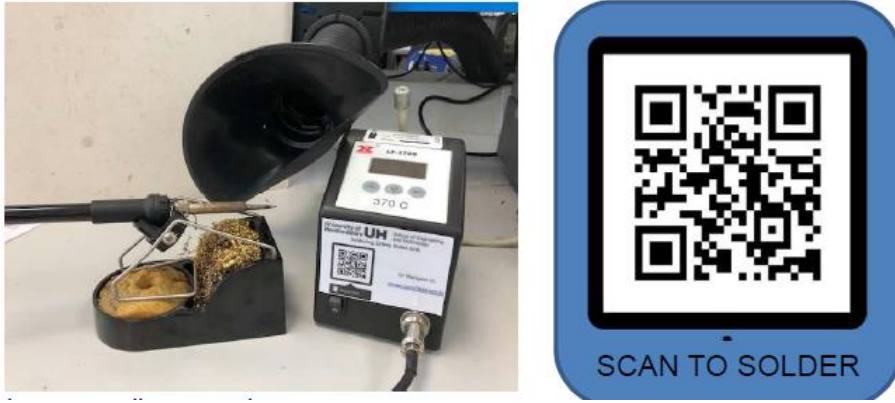
Figure 4: Examples of QR codes developed in this phase that are currently available to students.