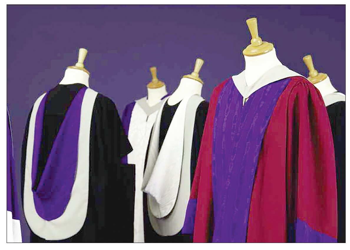
Fig. 3b. Postgraduate Master, Higher Doctor, Bachelor, PhD/Professional Doctor.

This decision meant that our awards ceremonies would continue to be presentations of graduates and diplomates to the Academic Board, rather than being the point of conferment.<sup>32</sup> The only exception to this is honorary awards, which are actually conferred in the course of the ceremony. This comes about because at the University of Hertfordshire honorary degrees such as the HonDSc are, for regulatory reasons, genuinely different awards from examined higher doctorates such as the DSc, and are conferred by a joint act of the Corporation of the University and the Academic Board, rather than upon the sole authority of the Academic Board. Our honorary degrees could therefore, in principle, have different academic dress to the corresponding examined degrees, a point to which we return.