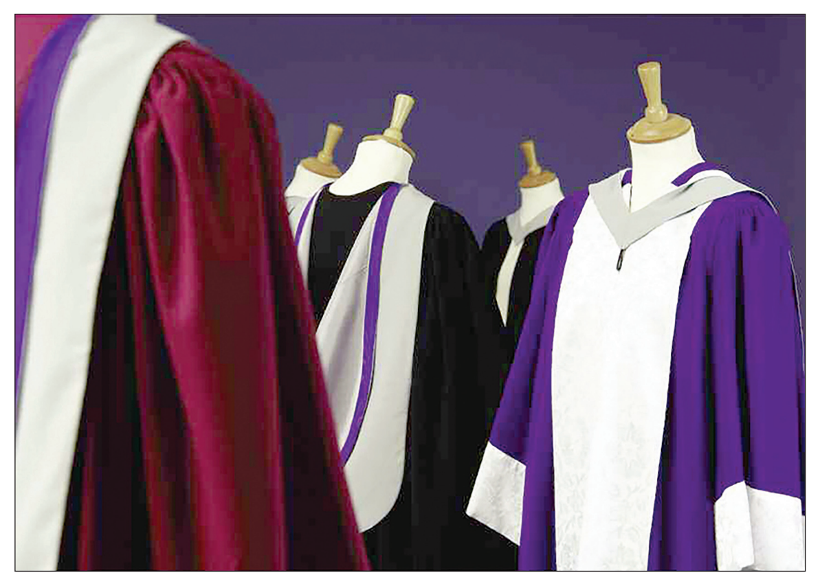
Fig. 3a. Academic Dress for Dummies: PhD/Professional Doctor (left), Postgraduate Diploma, Higher Doctor.

towards their degree to obtain a certificate, were they to request one? Should their gown reflect their standing? And did it then make sense to prescribe a different gown only for first year undergraduates?