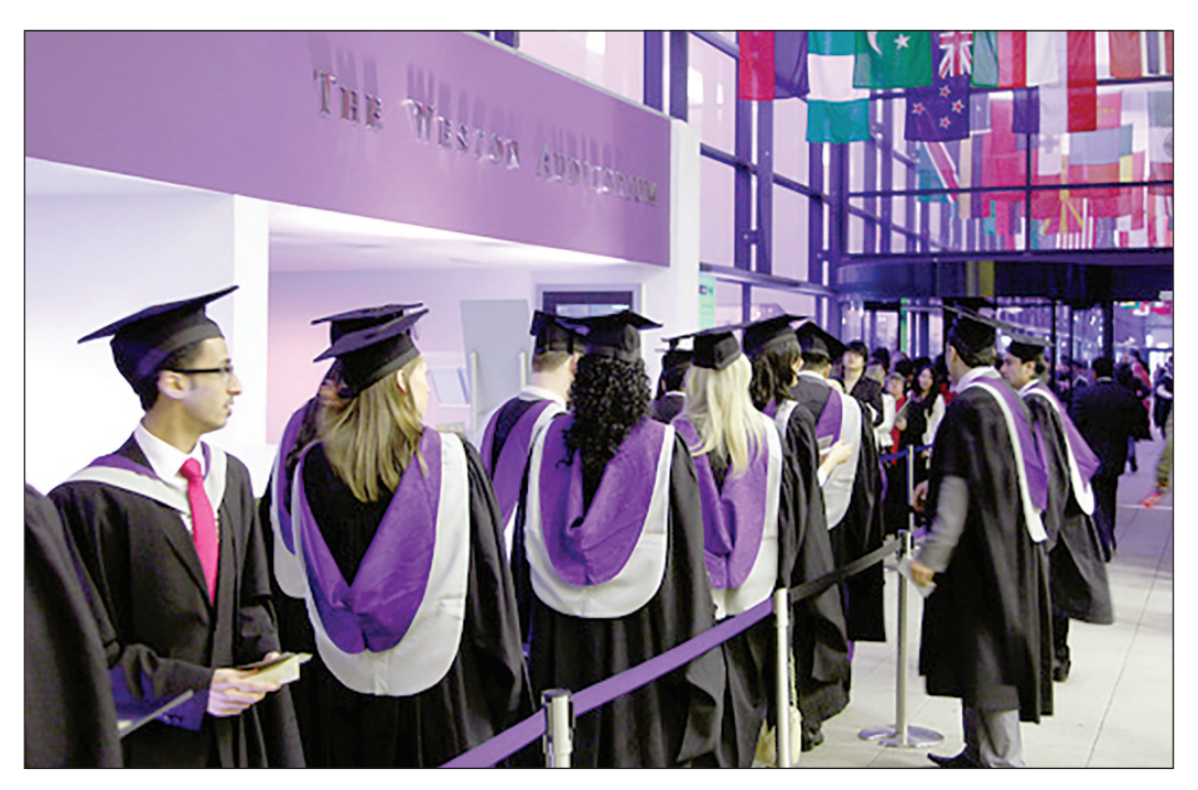
Fig. 1. Postgraduate masters queueing.

the lining. We considered alternative full shapes, but we already had considerable experience of the CNAA variant of the Aberdeen shape, and it seemed to meet our requirements.