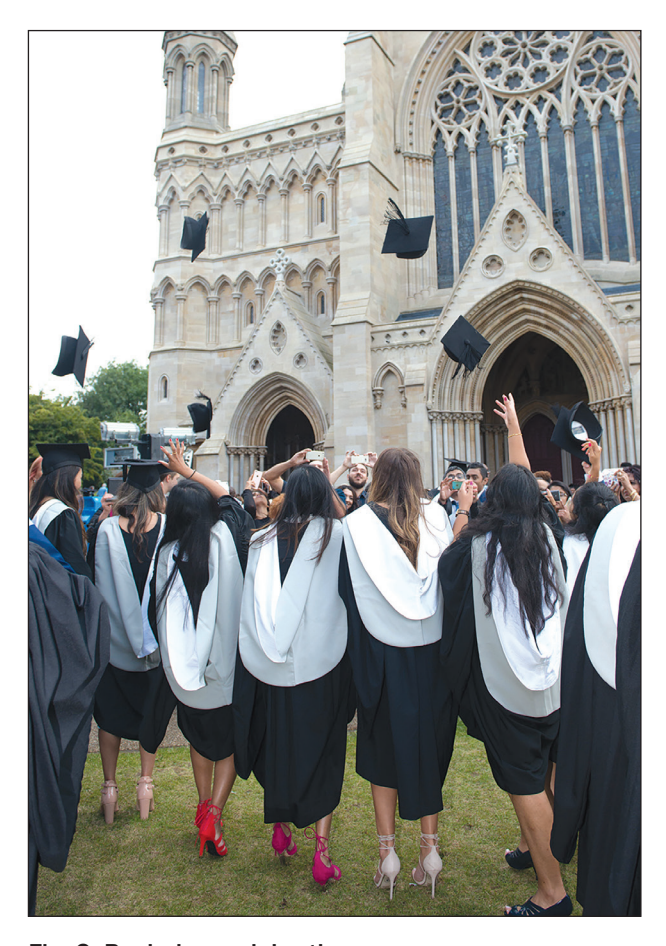
Fig. 2. Bachelors celebrating.

For doctors in undress we prescribed the same gown as for masters' degrees. We did consider the addition of a row of lace above the armhole<sup>29</sup> but in the end decided that black gowns were more likely to be worn if they were readily obtainable and did not require special adaptation.