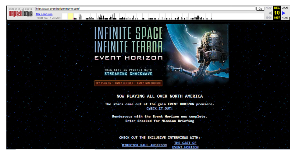
Figure 2. Eventhorizon.com © Golar Productions, 2022.

'multi-temporal archival experience' but the upshot is that the site becomes a jumble of bits and pieces<sup>90</sup> Following this initial exploration, I repeated the search for several other film sites from the same year including Men in Black (1997), Titanic (1997) and Alien: Resurrection (1997), and the problem is evident in them all. The Wayback Machine had archived the core site but was unable to archive all its assets. So, while they have not disappeared, these sites hardly constitute a complete or even stable object for the researcher. So, this exercise brings into question the conventional understanding of an archived document in the online context.