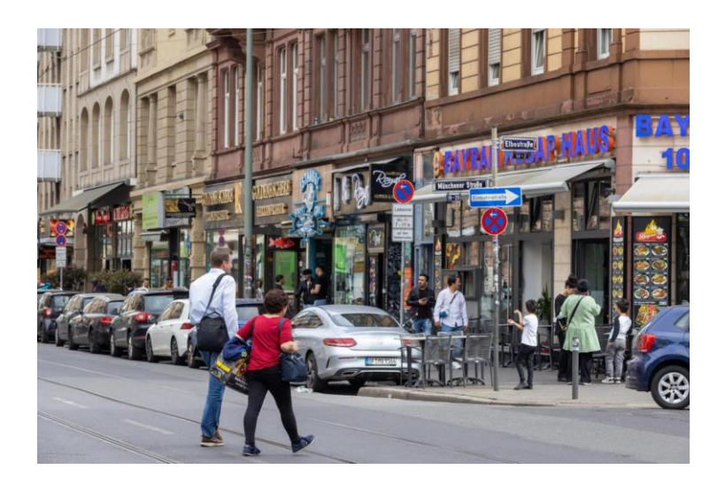
The study is part of a larger research project.

About 70, including children and grandchildren of Jewish displaced persons and Turkish Muslim migrant workers. But also post-Soviet Jewish refugees and people from Iran, Morocco and Afghanistan. Young adults from the second or third generation were also interviewed for the data collection.