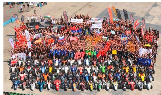
Figure 3: FS Germany 2009

The University of Hertfordshire have taken part in Formula Student for over 10 years with significant success ( http://www.racing.herts.ac.uk ). It is now world wide with thousands of students taking part