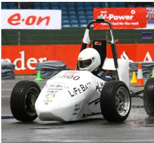
Figure 5: UH FS2009 class 1A Car

motivational and develops in the students a highly productive work ethic which naturally transfers to their more academic studies. It makes the students highly employable and most of these students have been offered multiple jobs by the leading motorsport companies on completion of their studies.