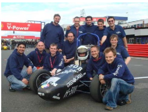
Figure 1: UH FS2008 class 1A team

Projects such as the design and development of Formula Student cars or Autonomous Unmanned Aerial Vehicles are important tools for developing students' experience of system design and integration, and also for providing experience of working in a team to meet technical, time and cost targets. Projects of this nature are an important part of the final year of MEng/BEng degrees in the School of Engineering and Technology at the University of Hertfordshire. This initiative to create a blended learning system was prompted by the normal periodic review of the goals, the teaching strategy and the resource plans for any teaching module in the university.