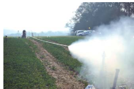
Figure 6: UH Rocket Test Sled 2009

The benefits of the Formula Student projects are now being expanded to other projects as the number of students taking the MEng at UH has expanded. Projects such as the Unmanned Aerial Vehicles and a Rocket Powered Sled ( http://www.rockets.herts.ac.uk ) for impact testing have posed similar challenges for aerospace students. Design of a futuristic Armoured Personnel Carrier for BAE Systems and the development of a fuel efficient and reduced audio pollution hovercraft ( http://hovercraft.herts.ac.uk ) have challenged students studying Mechanical Engineering.