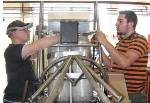
Figure 2: FS2008 class 1A construction

The learning opportunities presented by the rich environment of challenges and experiences seen in student engineering projects have long been recognised to favour a constructivist and experiential model of learning. However, there was growing evidence that different teaching regimes could be applied both in the preparation for, and during the conduct of, student projects. In varying measure complementary learning approaches had been informally employed, but not according to an explicit strategy having uniform and mutual benefit across all projects.