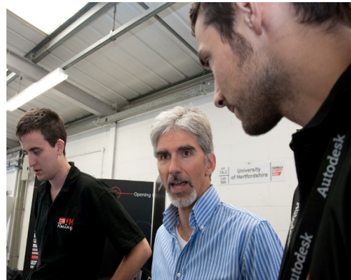
Figure 4: UH student discussion with Damon Hill OBE, ex-Formula 1 driver

marketing ability, in addition to the core activity of innovative design, quality production and the obvious performance issues associated with the motorsport industry. The practical nature and competitive nature of Formula Student is highly motivational and develops in the students a highly productive work ethic which naturally transfers to their more academic studies. It makes the students highly employable and most of these students have been offered multiple jobs by the leading motorsport companies on completion of their studies.