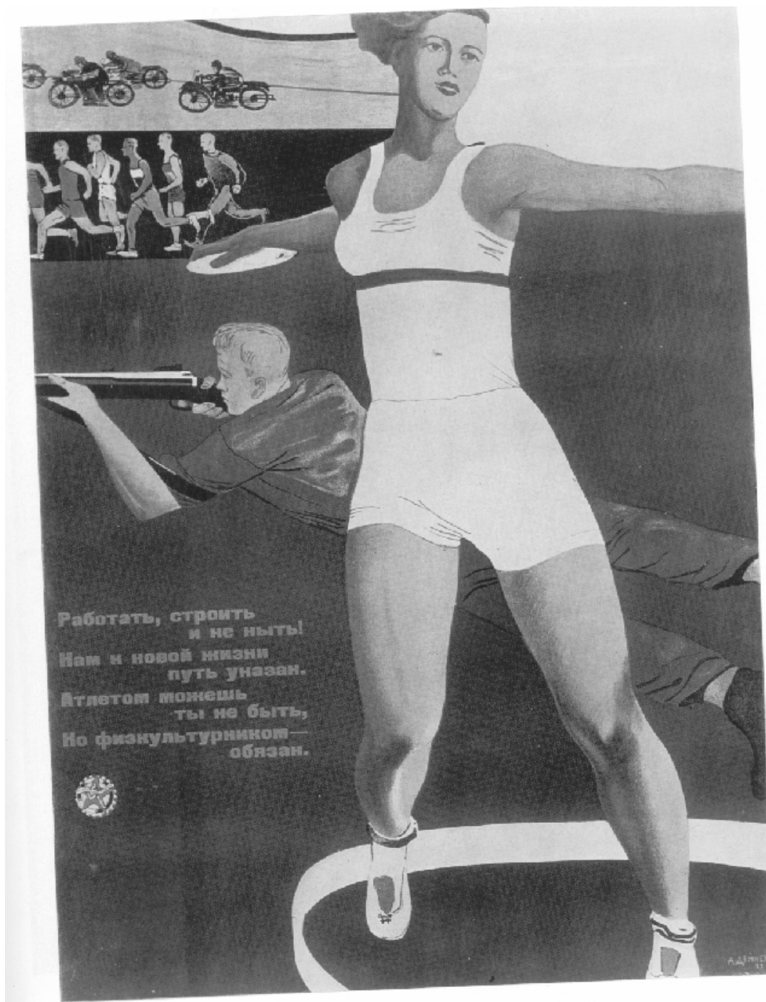
4. Female Pyramid (1936), 40 x 29.5cm. Photograph by Aleksandr Rodchenko.

(The Rodchenko and Stepanova Archive, Moscow; VAGA, New York)