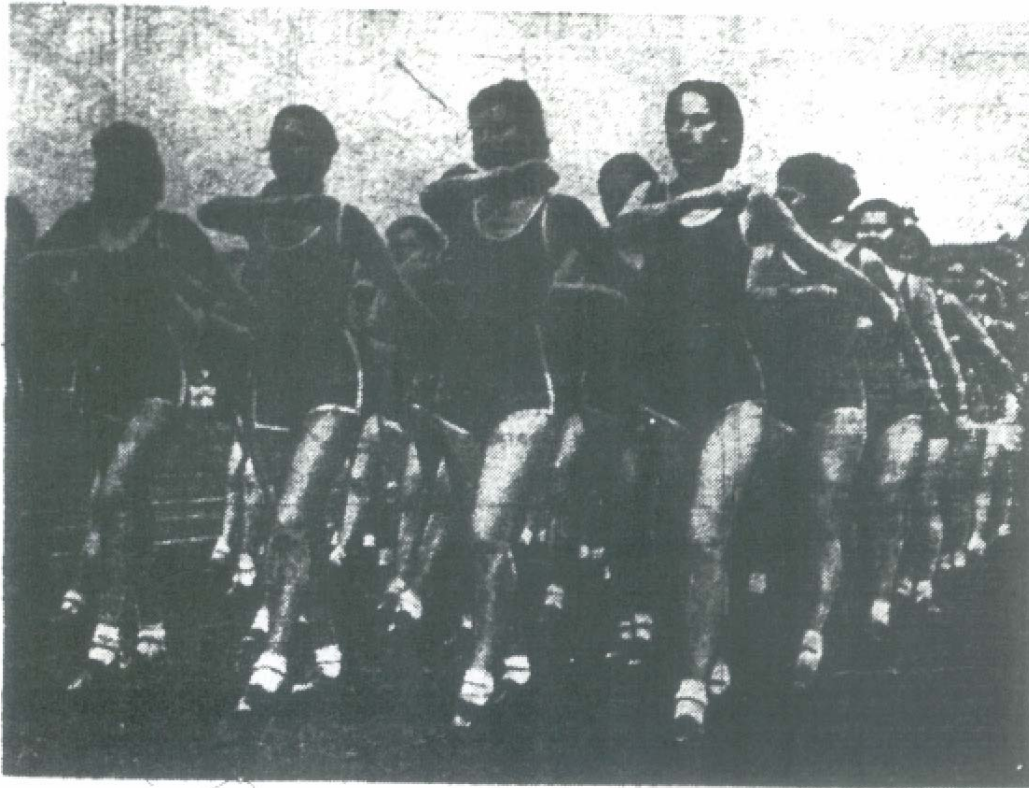
Празднование Всесоюзного дня физкультурника на стадионе «Динамо» в Москве началось торжественным маршем. На снимках: слева — колонна знаменосцев; справа — юные физкультурники