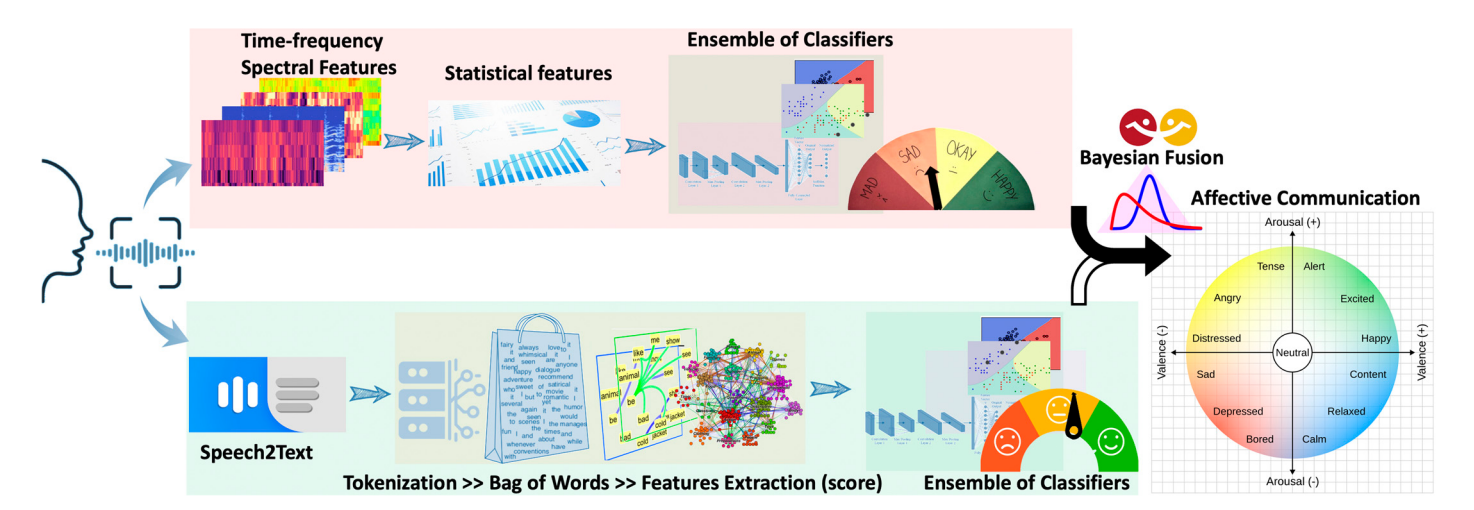
Figure 1. Overview of the proposed architecture for affective communication merging speech emotion and sentiment analysis.

The structure of this paper is outlined as follows: Section 2 explores the background research reviewing the relevant literature. In Section 3, we introduce our proposed work and outline its development. Section 4 showcases our experimental results and insights. Finally, Section 5 presents the conclusions drawn from our findings and outlines avenues for future research.