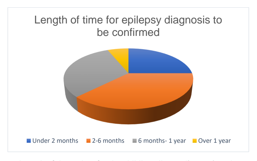
Figure 3.3: Length of time taken for the child's epilepsy diagnosis to be confirmed

The parents identified their child's epilepsy diagnosis on the demographic pro forma – further specific details about this, together with the prescribed medication, are provided in Table 3.1. Parents were asked how long it had taken for their child to receive a confirmed diagnosis of epilepsy. This ranged from under 2 months (n = 4) to over 1 year (n = 1) with most having been diagnosed within 2 - 6 months of having initial symptoms (n = 6).