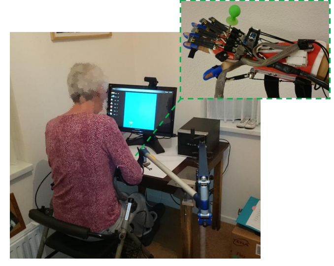
Figure 1. Training system at home.

The training environment was available within a motivational user interface including feedback on performance, which was displayed on the touchscreen. The general recommendation for training was about 30 minutes per day, six days a week. Participants could train at the time