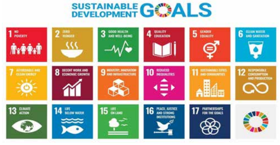
Figure 2. The 17 United Nations sustainable development goals