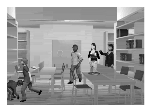
Figure 2: A scene from a direct/physical bullying scenario.

A key requisite for a successful virtual learning environment to deal with bullying problems concerns the content of the bullying scenarios and back stories to be implemented into the system for the child user to interact with. The project is currently using a software package called 'Kar2ouche' (http://www.kar2ouche.com/ ) with children in primary schools in the U.K., Germany and Portugal and research members with expertise in the areas of bullying to develop believable and engaging bullying scenarios which take cross-cultural differences into account. This software package is a useful tool as it allows the user to choose different environments, different characters, different props and the use of text, boxes, thought and speech bubbles. The stories aim to capture both direct and relational bullying behaviour. Figures 2 and 3 illustrate clips from a direct/physical bullying scenario and a relational bullying scenario.