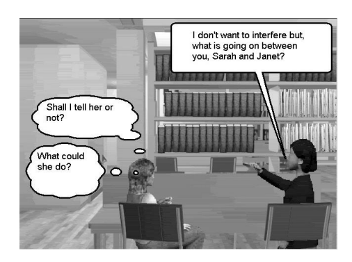
Figure 3: A scene from a relational bullying scenario.

A major issue in VICTEC and other intervention approaches is not to teach bullies how to become better bullies. For victims, the group that we focus on in VICTEC, an education in social intelligence and problem-solving is hoped to have a positive effect. An interesting research question is whether the 'pure' bullies are able to empathise with the characters in the VICTEC project or whether they display a cold calculated demeanour towards the dramas. However, for bullies any 'awareness' programmes might produce a counterproductive effect. Clearly, bullies should not be isolated and separated from any intervention programme. Thus, what could help in intervention programmes for bullies?