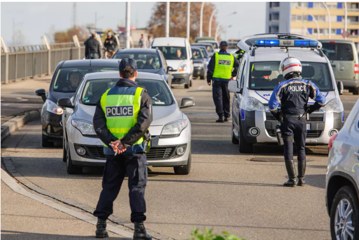
Police check vehicles on the French/German border in 2015.

But after Brexit, the UK won’t have automatic access to the security corporation framework. As a result, it will default to the inefficient, costly and politicised extradition treaties under international law, that the EAW replaced, unless a security partnership is concluded that will allow the UK access to the EAW scheme.