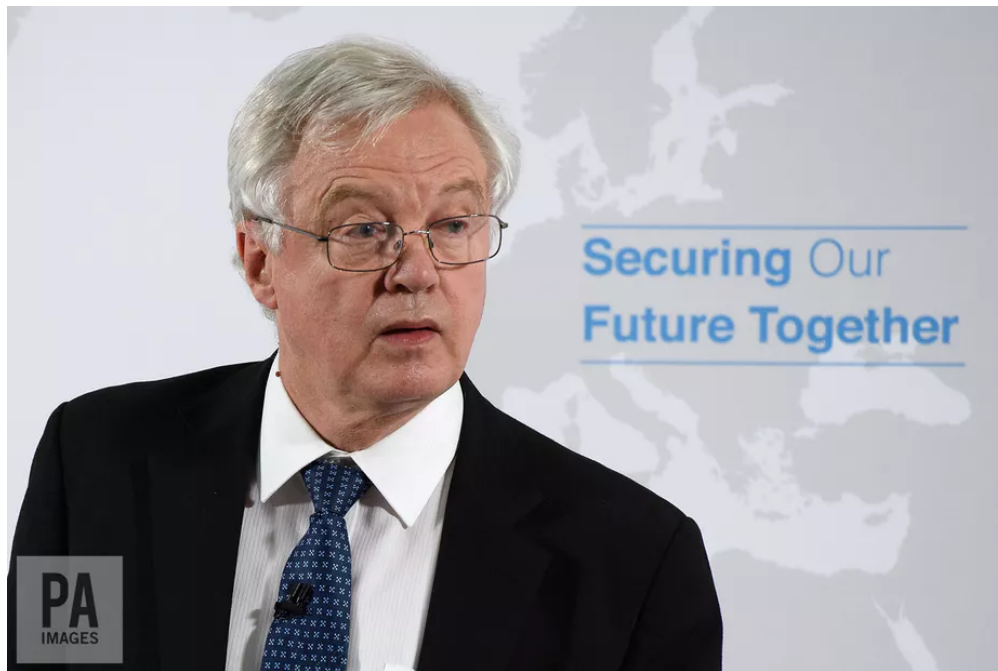
David Davis: In search of a new deal on security after Brexit.